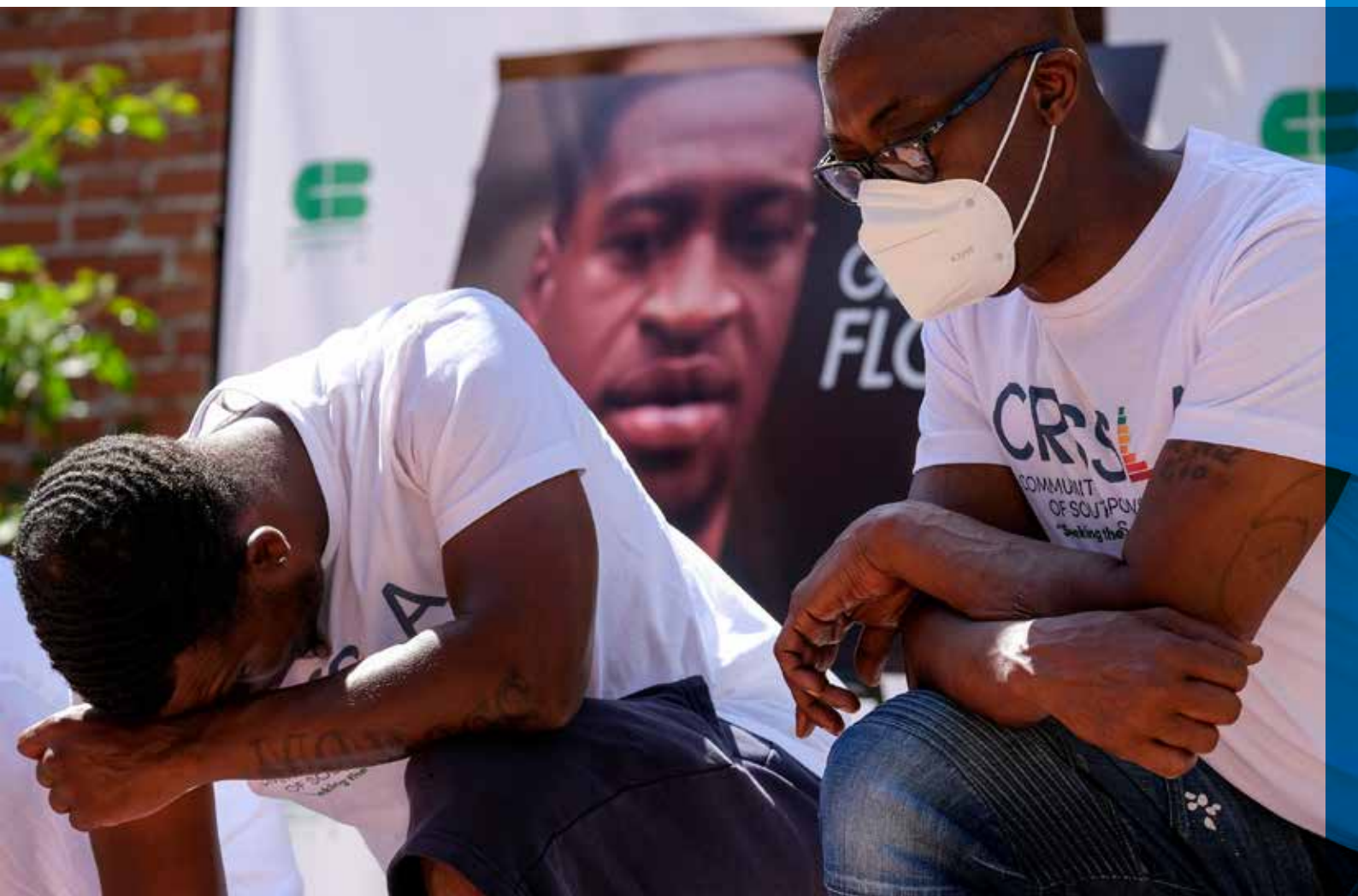
People pray and take a knee for nine minutes and 29 seconds in memory of George Floyd on the first anniversary of his death, May 25, 2021

We would do well to remember the different aspects of institutional racism described by Lord MacPherson in the 1990s. One of these is when established groups in society exercise their power in such a way that people, from different backgrounds, feel that they don't really belong. The phrase, "We've always done it this way," is one I sometimes hear, and it betrays an unwillingness to be changed on our own soil. Sadly, the requirement of the majority can all too often be, "When in Rome, do as the Romans do!"