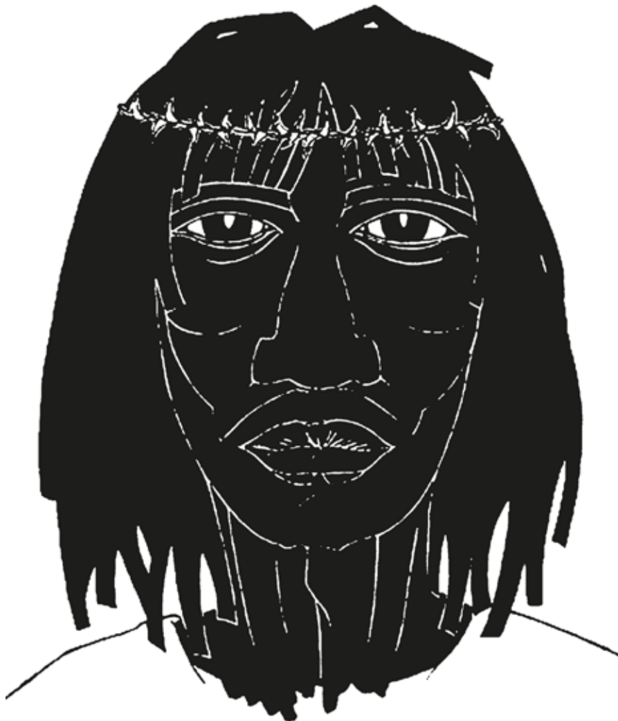
'Jesus as Dread'; The 'Dread' Christ is one who sides with all oppressed people in their struggle against anything denying them full humanity. From 'The Christ We Share' [USPG 2012]

I am completely convinced that if we are to be modelling the kingdom of heaven here on this earth, then we need to be passionate about intercultural living! It is not enough to just tolerate one-another, we need to be willing to enter each other's spaces. We need to be willing to be mutually inconvenienced. And when we do this, we start to create, together, a beautiful and larger story than perhaps what we started with!