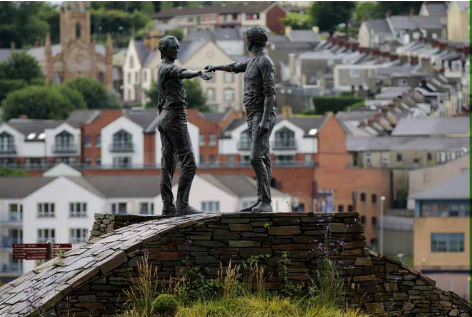
'Hands across the divide'; peace sculpture in Derry

we cling tightly to control of “how things are done” in Church, or do we look at it as a place where a diverse group of people, all image-bearers of God, gather to worship in ways that reflect their whole selves?