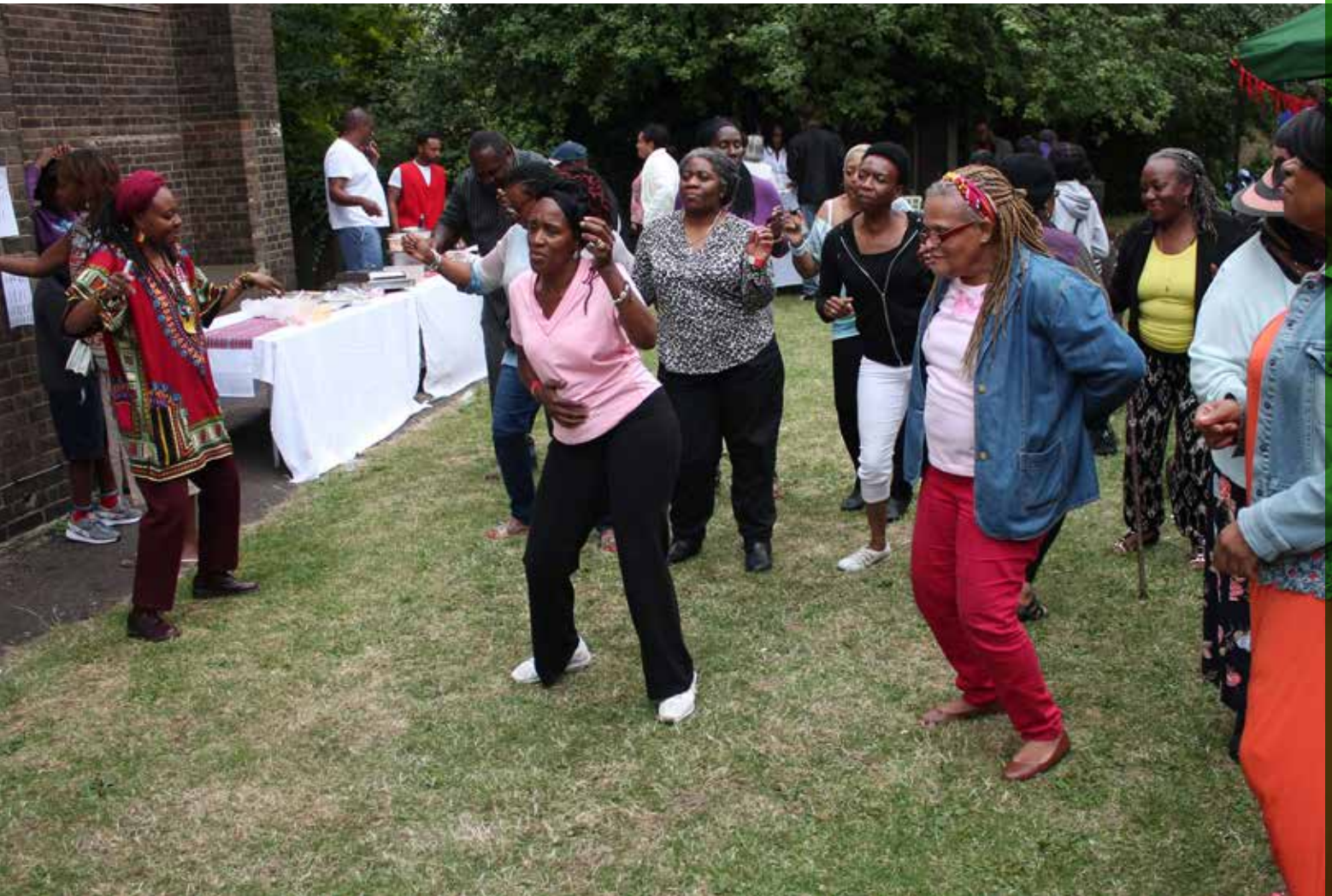
Black women at a charity event.

Creating racial justice requires action, while it is early days in Ireland and the wheels of culture could move ever so slowly, every little step will count. The action needs to be embraced by all the cross section of society if it is to be effective, as exemplified above.