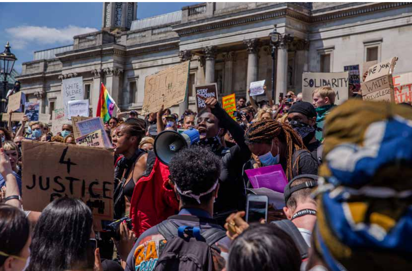
How should the church seek to engage Black Lives Matter?