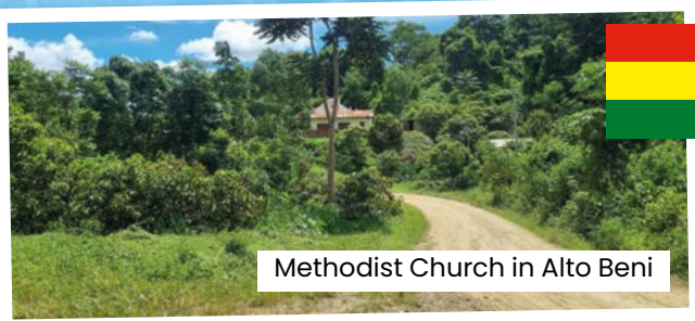
Methodist Church in Alto Beni