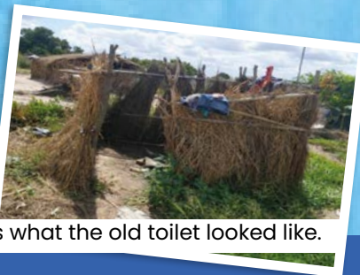
This is what the old toilet looked like.