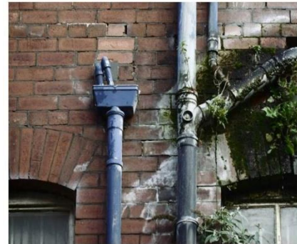
Leaking gutters or drainpipes are often the cause of damp walls.  DP169342

Guidance on Annual Property Inspections can be found here . As well, Churches for Cumbria Trust has created a useful Maintenance Checklist to assist those looking after church buildings.