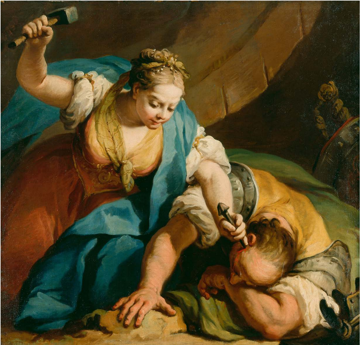
Jacopo Amigoni Oil 1739