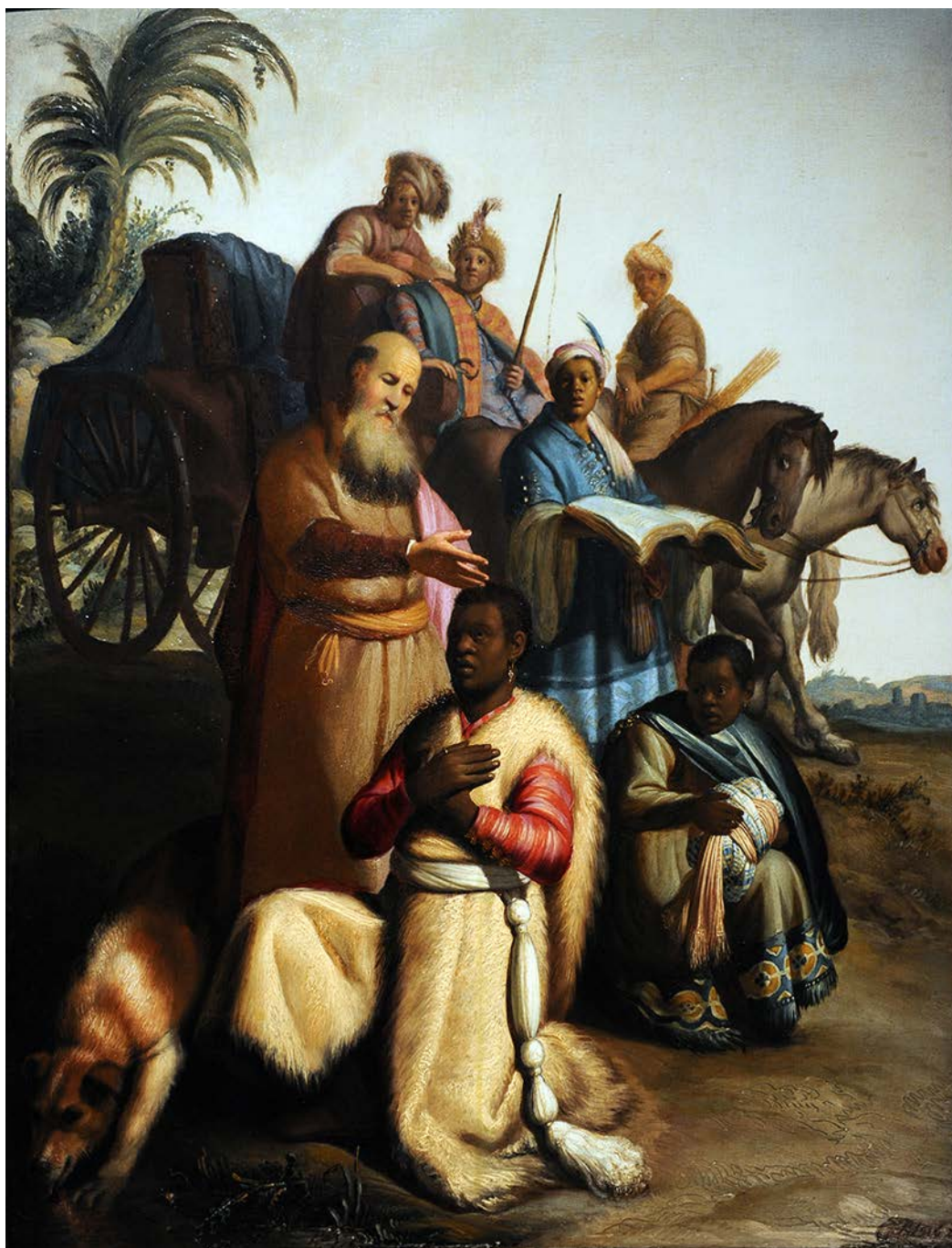
Rembrandt Harmenszoon van Rijn Oil 1626