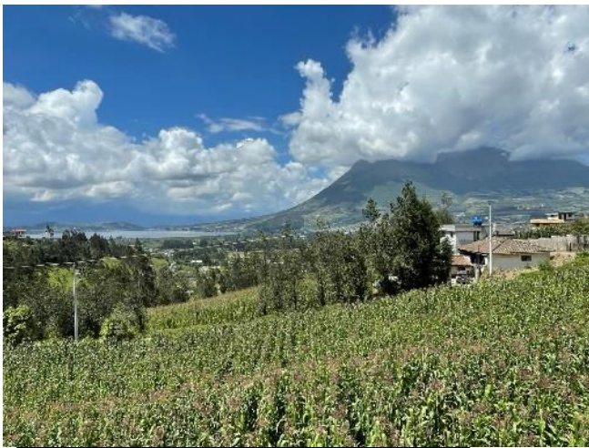
Beautiful view of Imbabura Volcano and San Pablo lake from El Pijal Methodist Church

For Pastora Fabiola, the church leaders, and me (and my currently packed schedule).