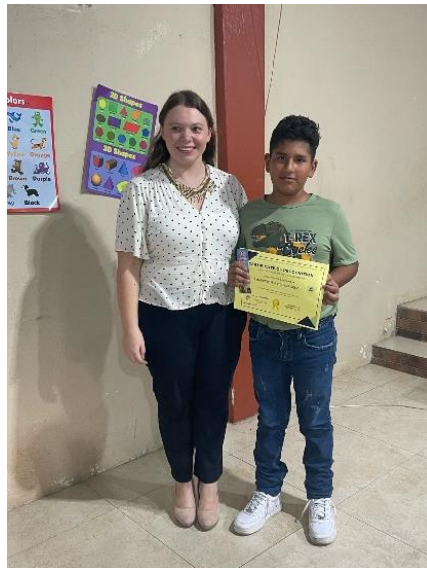
Presentations at our English event in February