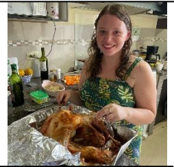
Turkey in the Amazon with (nearly) all the trimmings

January 7 th was a momentous day, marking my birthday, which we celebrated with members of the church at a local restaurant. As we were having dinner, little did we know that on the other side of Ecuador, a huge jail heist was taking place, as one of the most notorious gang lords in Ecuador escaped from prison and disappeared without trace. The following day, a State of Emergency was declared, and the day after that, Ecuador's new President, Daniel Noboa declared that Ecuador was now in an 'Internal State of Conflict'. Things were tense for a while, and unfortunately, many church activities were cancelled as schools were also closed. This meant the end of mum and dad's time was very interrupted and unfortunately, they didn't get to see all the church activities I work with, but we still had a fantastic time together. In the midst of this, my 2-year visa was also due to expire! There were a few stressful days in Tena and Quito, but the renewal application was submitted and granted. It's incredible to think that I've been in Ecuador for over 2 years now. As I write this, we are still officially in both a State of Emergency and an Internal State of Conflict, but life has more or less returned to normal.