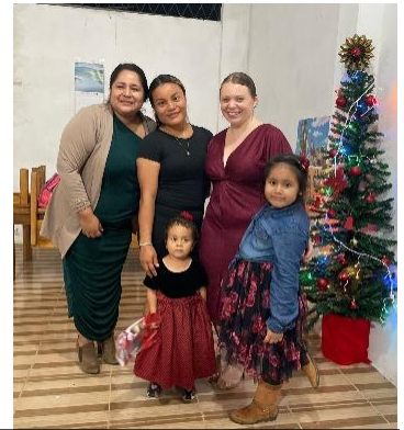
Community lunch cooking team (Church Christmas Dinner)