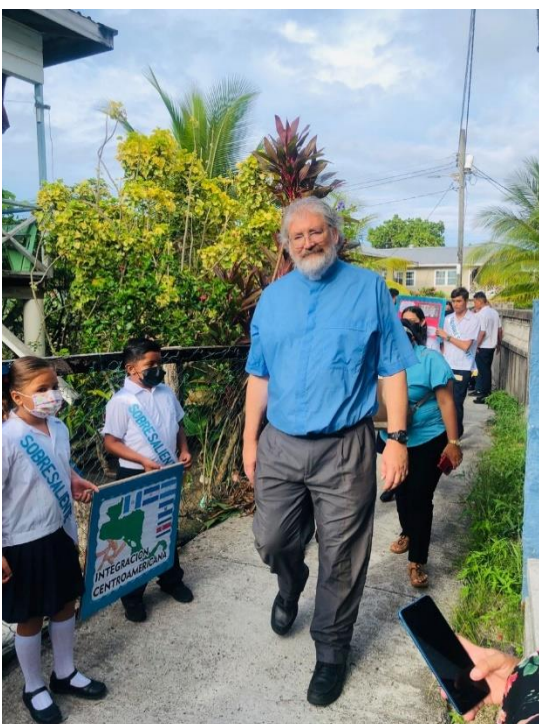
Leading the independence parade on the Cays