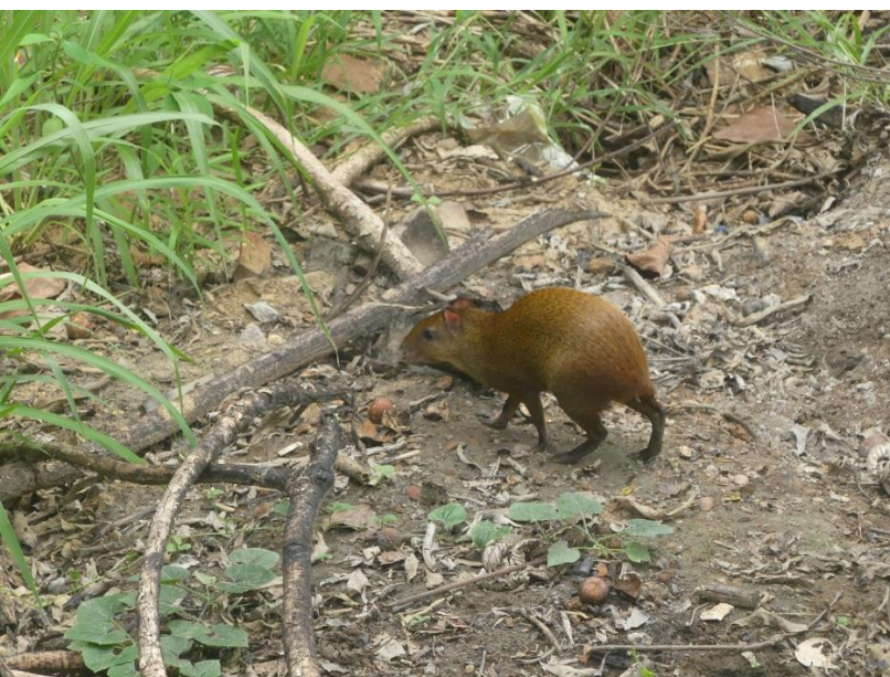
Central American agouti