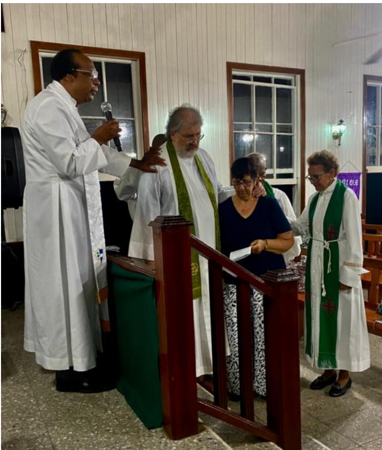
Welcome service at Mizpah