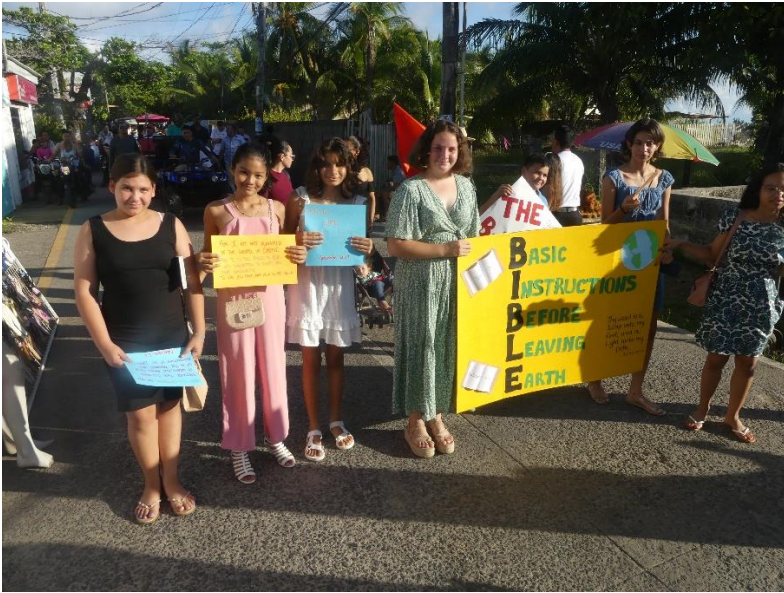
Taking part in the Bible Day march