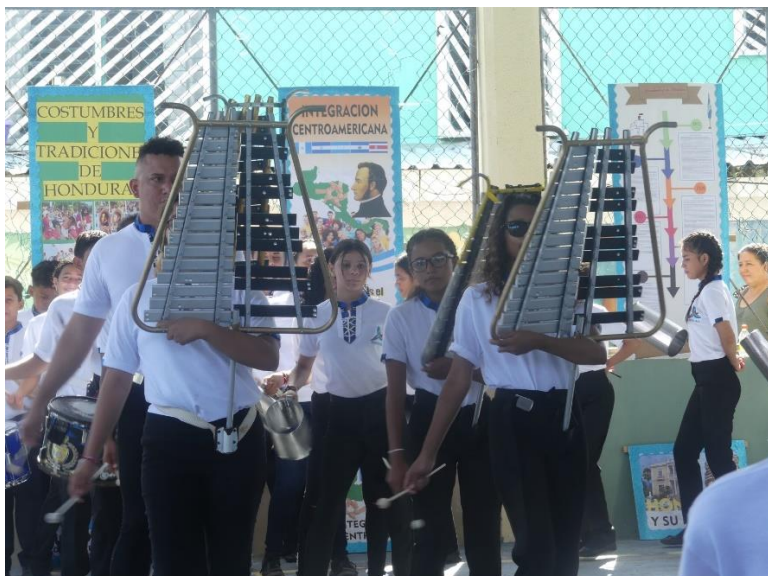
Utilian band at the Cays school