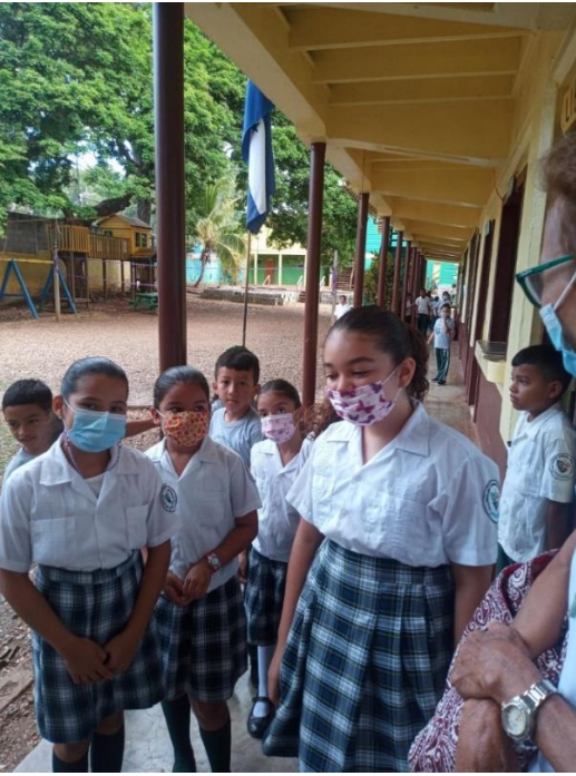
Children at the Methodist school