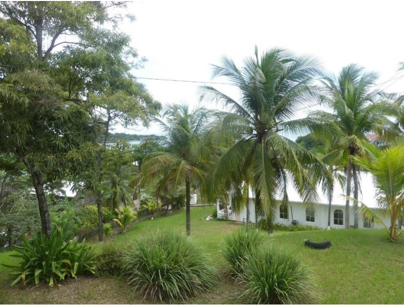
Wesley church, Roatan