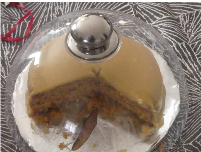
Caramel cake (like fudge)