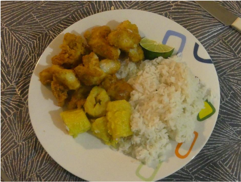
Breaded fried conch & plantain