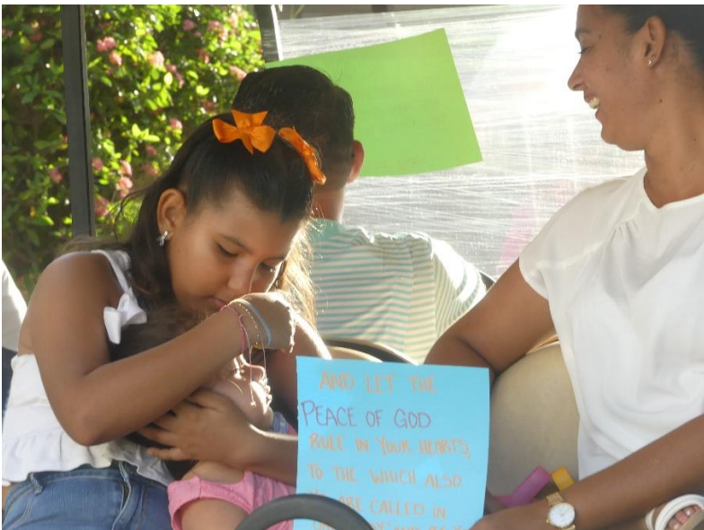
The peace of God