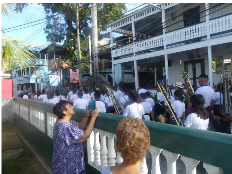
Utila parade passing mission house