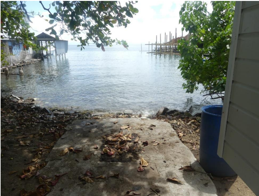
Our back garden