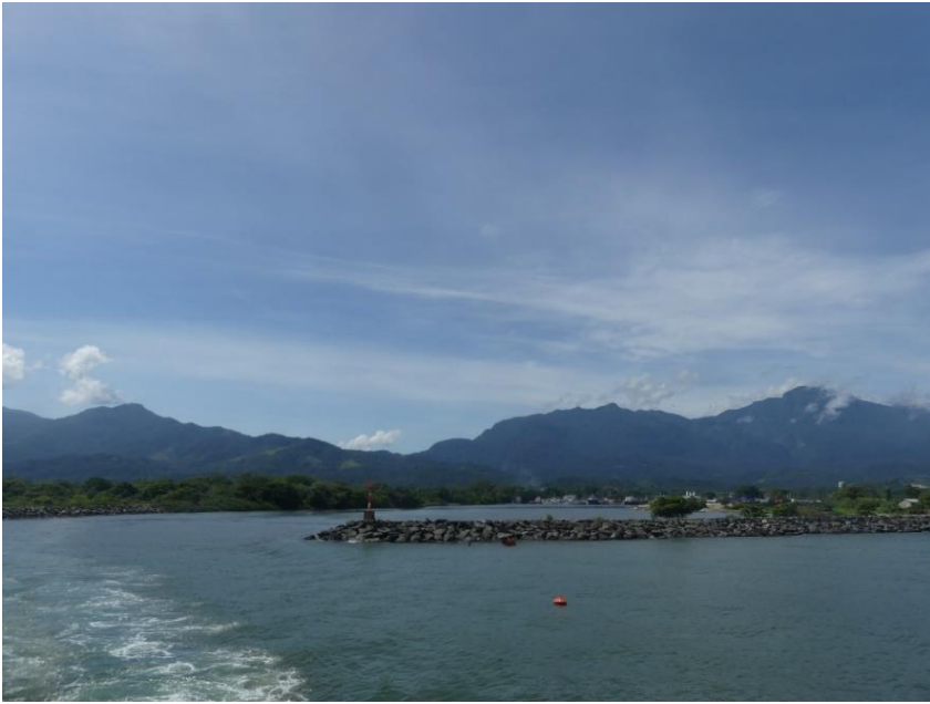
Leaving La Ceiba (back this week)