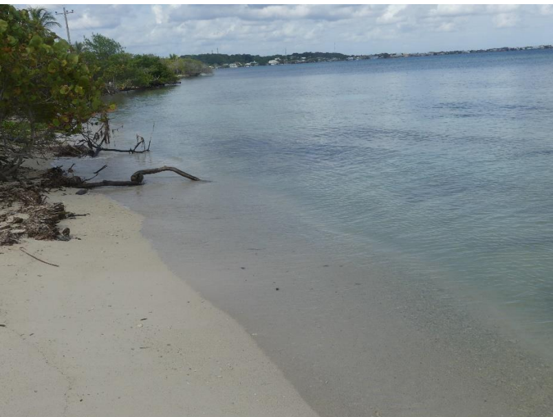
Coast road looking back to town