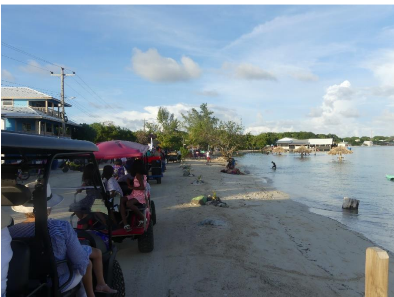
Bible march at the public beach