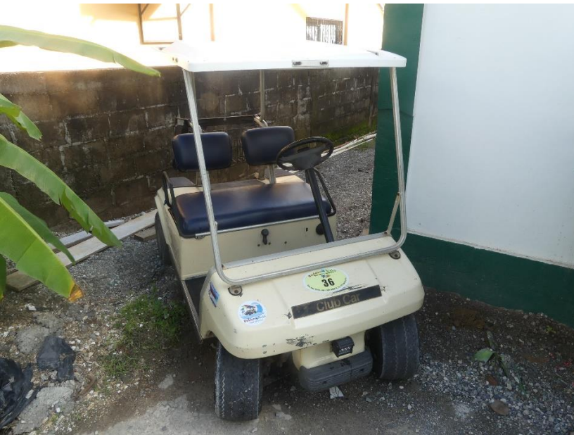
Our hired golf cart