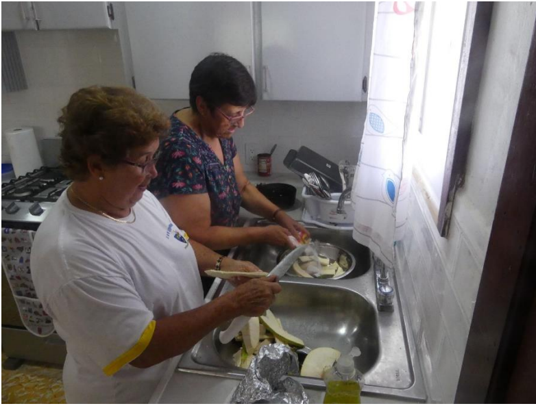
Learning to prepare fried breadfruit