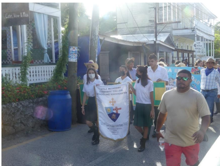
Methodist school section