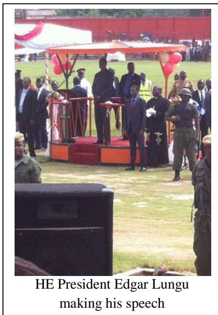
HE President Edgar Lungu making his speech

After breakfast on Sunday we were transported to the stadium and having cleared security, (My Sgian dhu remaining undiscovered!), we were directed to the Synod part of the stand at the Callow Pavilion. A comfortable black leather-padded three-piece suite and side-tables had been arranged for the President, First Lady and their entourage. They were to be the guests of honour. For the next hour or so the stadium gradually filled up until a congregation of thousands had assembled.