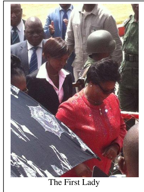
The First Lady