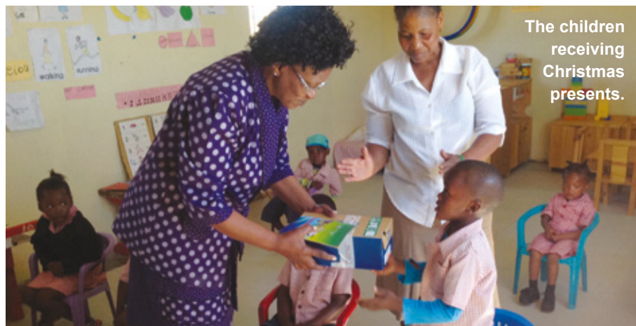
The children receiving Christmas presents.

The nursery team would like to start a vegetable garden with the children, so that they can learn about growing food, and add to their meals.