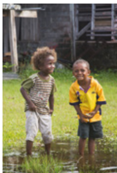
Cover image: Two boys playing in a puddle of water at the local market – Batuna, Solomon Islands village.