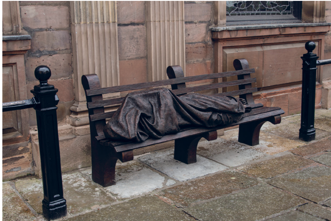
Bronze of Homeless Jesus.

A bronze of Homeless Jesus was installed and unveiled on 24 April, 2018, outside St. Ann's Church in Manchester City Centre.