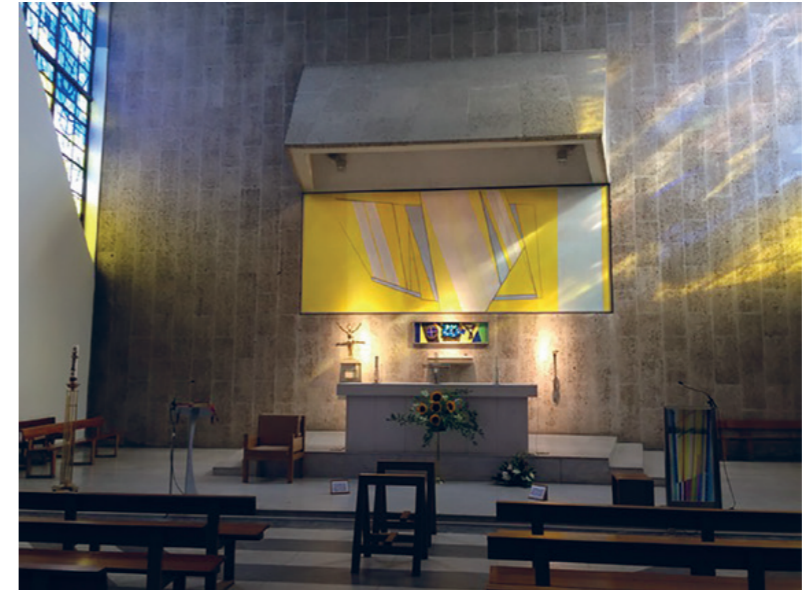
The reredos and tabernacle, Blessed Sacrament Chapel, Liverpool Metropolitan Cathedral.