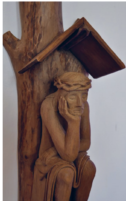
Santiago Bell's Jesus in the Church