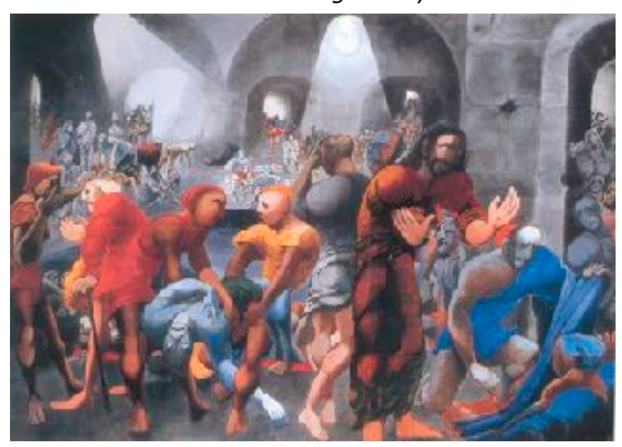
Edward Burra, The Pool of Bethesda, watercolour, 1951-2, 110 cm x 152 cm

Based on an illustrated talk given by Revd Bruce Thompson