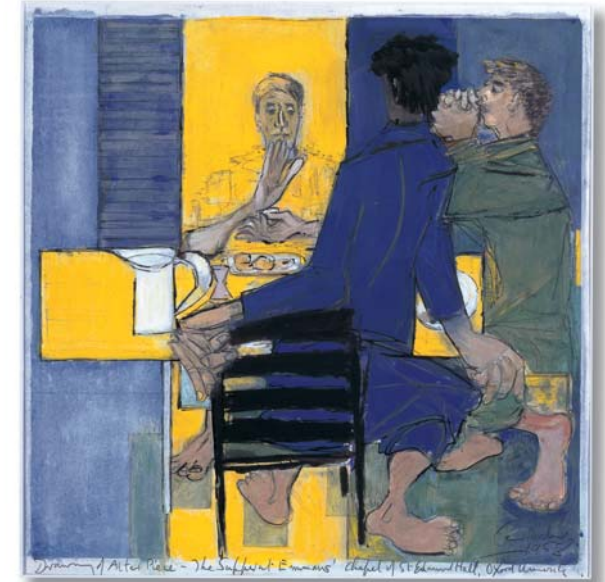
'The Supper at Emmaus' by Ceri Richards (purchased from the artist 1962)

The Methodist Church Collection of Modern Christian Art, often known as the Methodist Art Collection, has been seen and appreciated by thousands of people. Famous names from the British art world of the last 100 years are represented, such as Edward Burra, Elisabeth Frink, Eric Gill, Patrick Heron and Graham Sutherland.