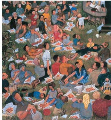
'The five thousand' by Eularia Clarke (purchased from the artist 1965)