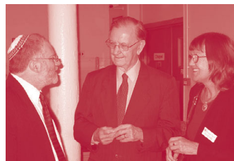
Panelists at the public inter faith event in Edinburgh during Conference 2006