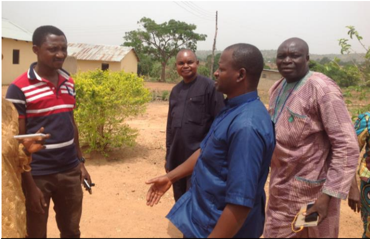
Few lecturers of Zonkwa Theological College on site

After a long day of travel, I arrived Kaduna late at night. The next morning was the first day of the Kaduna Synod meeting that was held at the Methodist Cathedral on Constitutional Road in Kaduna. Due to religious violent attacks within Kaduna City earlier in the decade, three different Methodist congregations had relocated onto the same premises as the cathedral for safety. In addition were the archbishop's manse, a primary school and a nursery school. These different congregations retain their historical identities however; church membership has been dropping in numbers with people relocating to safer cities. Archbishop Sunday Idoko, the Synod Bishop met with me before the Synod gathering and I later travelled about 200 kilometres from Kaduna to Zonkwa accompanied and driven in a vehicle by Rev Ali Shettima. At the Methodist Theological College in Zonkwa, I met with the College lecturers since students were still off on Easter break.