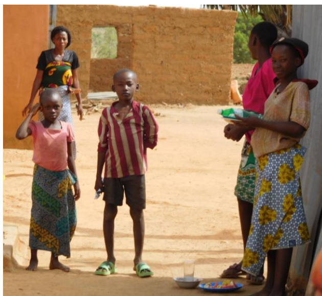
Internally displaced families in Northern Nigeria