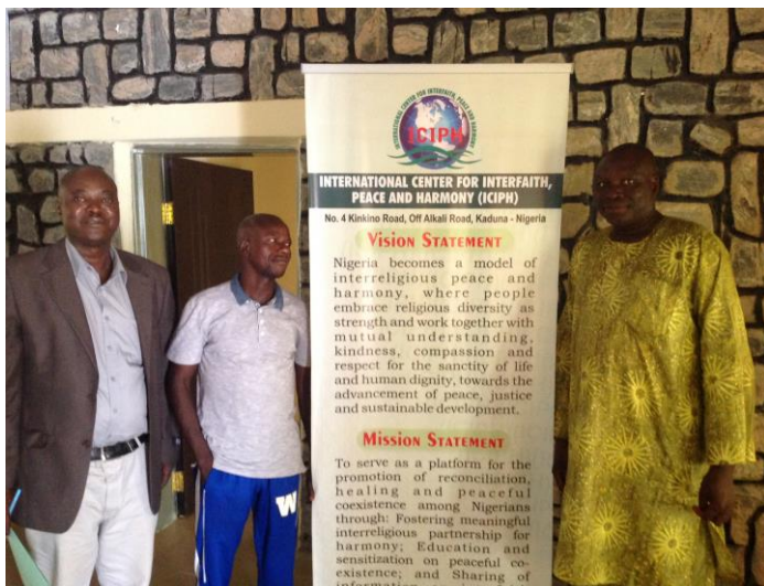
PROCMURA Area Representatives in Kaduna - Nigeria