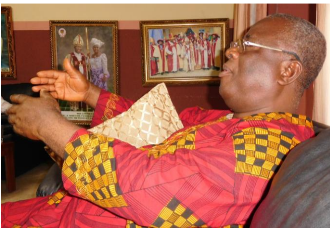
Prelate Samuel Uche – Head of the Methodist Church Nigeria

Conference has approved to also upgrade of the Theological College at Zonkwa – Kaduna State. As from 2017, the college will offer undergraduate courses in addition to existing certificate and diploma courses. This should increase the number of enrolments from Northern Nigeria because it is the only Methodist Theological institution in Northern Nigeria. Prelate Uche also mentioned that MC Nigeria wishes to re-introduce adult literacy programmes within the rural communities to improve participation of adult females in leadership roles in rural churches. In addition it is hoped this would also positively impact social, spiritual, economic and community living in villages.