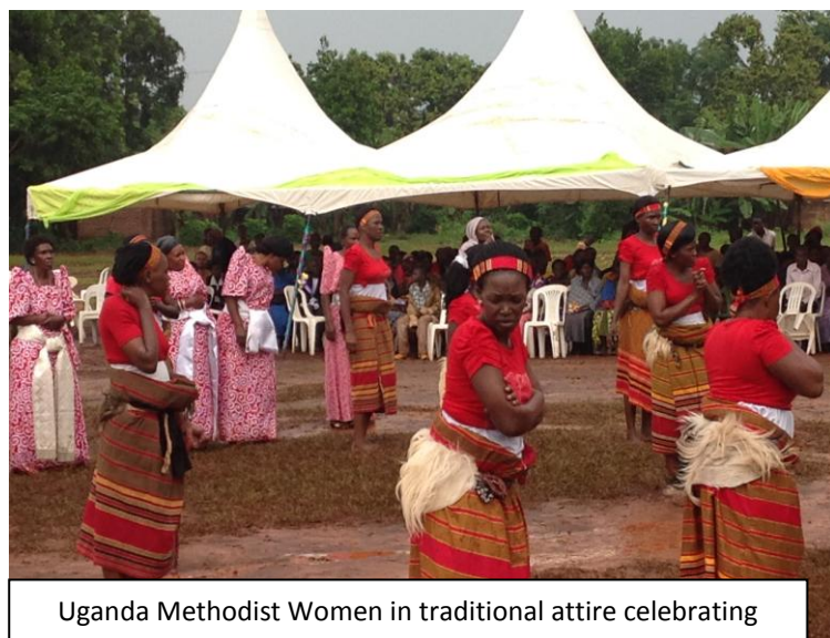
Uganda Methodist Women in traditional attire celebrating