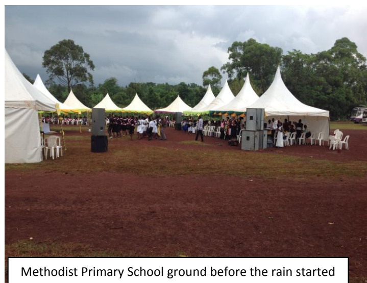
Methodist Primary School ground before the rain started

As from about 10.00am just after the service started, it poured! It was windy, wet and cold. The dusty roads and grounds became very muddy, yet people waited until after the Holy Communion service in the evening. In appreciation of their patience, everyone was fed. Guests gave generously to offset the debt incurred in putting up such a wonderful programme.