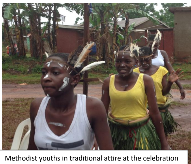
Methodist youths in traditional attire at the celebration