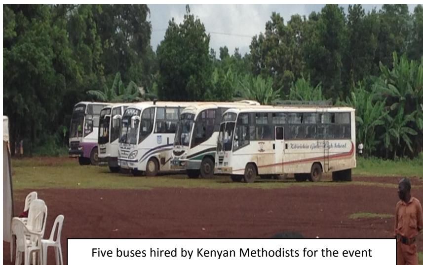
Five buses hired by Kenyan Methodists for the event

On Sunday 17 January 2016, Jinja witnessed a historical day. Five full buses of Kenya Methodists from all synods of Kenya came to usher in their newest synod. Every synod of MCK was represented with over 400 Kenya Methodists in attendance in the company of Uganda government dignitaries and friends. MC Uganda members streamed in from nearby villages as well as international well wishers and supporters. In spite of the deluge of rain, guests patiently sat through a seven hour service held at the one of MCU's primary school premises. The local government official praised the leadership of the school and commented on its good reputation and