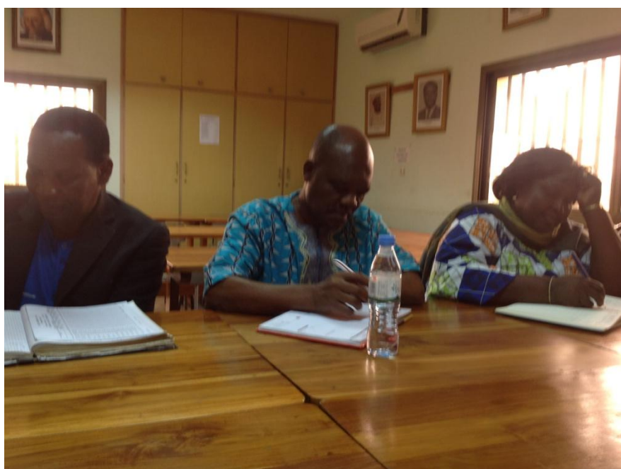
Accounting assistant, Accountant and Vice – President of EM Togo