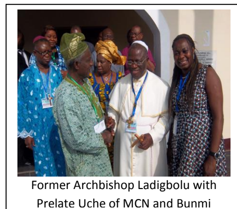
Former Archbishop Ladigbolu with Prelate Uche of MCN and Bunmi