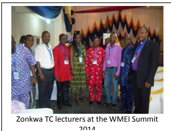
Zonkwa TC lecturers at the WMEI Summit 2014