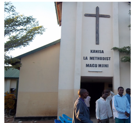
Church built by MCT Irish Methodist friends