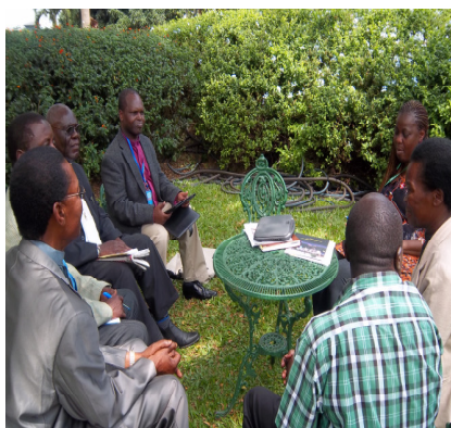
MC Uganda ministers