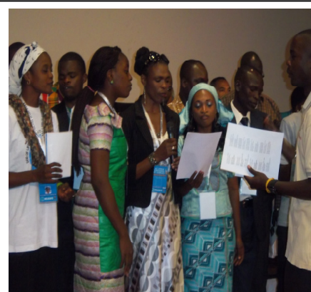
AACC young Theologians' choir