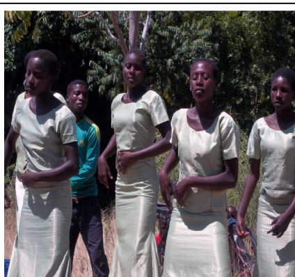
Youths dancing and worshipping God by the proposed school