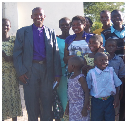
Children at Burgudi Methodist Church, Tanzania