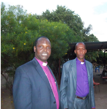
Bishop Ntombura of MCK and Bishop Leopold of MCT