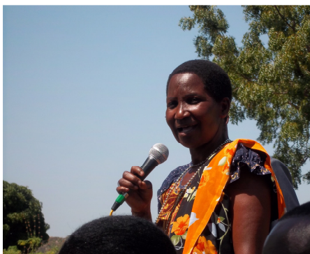
Community leader thanking the Church for the first Secondary school in the locality

MC Kenya is currently sponsoring a Sudanese minister in training and has asked MC Britain to offer support to MC Sudan. The minister in training approached MC Kenya for help and following the independence of South Sudan, the minister wishes to operate as a district. There is a Methodist Church congregation however financial support for office administration and communication would make it better accountable with partners. The annual grant would be administered under the supervision of MC Kenya. The MCK director of missions travels at least once annual to encourage and meet members in Sudan. MCB has offered financial assistance in the past.