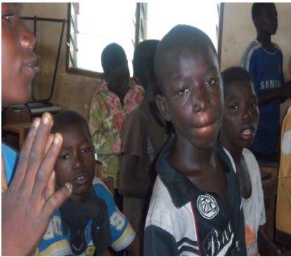
Street kids worship session

I visited the Street Kids project at Accra on Saturday morning -9 th March at the Methodist School premises. The boys were led in a worship session by volunteers after which, they got a bath package each. They received hot meals followed by a resting period since they all sleep rough. A lovely lady brought a bag of fairly used clothes for the boys. They sometime get the opportunity to change clothing and wash dirty ones. Later in the afternoon they enjoyed a game of football.