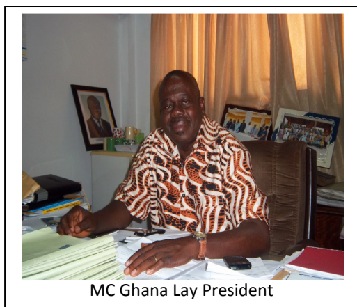
MC Ghana Lay President

This post was known as the Vice President of Conference and has a 'three-year' tenure with limited resources to support the office. Therefore the post holder volunteers on a part time basis and serves as the Head of the Lay council that consists of 16 lay chairpersons from the Dioceses and ten lay group leaders e.g. Choir, Men's Fellowship, Women's Fellowship, Youth Fellowship etc. Since the Methodist Church Ghana members are mostly laity, every third Sunday of the month offers an opportunity to fundraise for the Lay movement. A week long programme is also scheduled annually - the third week of March for members to come together for outdoor activities as well as organise a memorial lecture. The church selects a topic to consider how the Church could positively influence the government or contribute to prevailing social or justice issues.