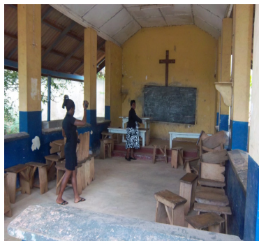
Renovating old chapel as multi-purpose centre