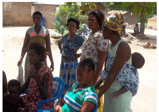
Disfigured members of the community after Buruli Ulcer infection