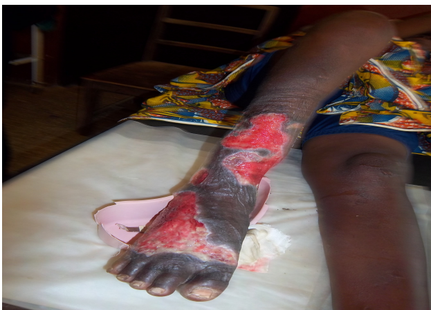
Buruli Ulcer patient responding to treatment

I visited this Centre with Mr Ben Oche – the Buruli Ulcer co-ordinator. I had the opportunity to meet with the medical staff and saw few of the out patients attending for wound dressing or prophylactic treatment. Some of the patients had to be offered food and accommodation due to mobility problems and transportation costs. The disease is very debilitating as it could take over one year for the wound to heal and it sometimes requires plastic surgery, amputation or skin grafting if the disease is detected at a late stage. It is difficult to detect early signs because the mode of transmission is unknown and victims experience no pain or rash at the early stage. Buruli Ulcer is endemic in the West African region and currently receiving attention from World Health Organisation to alleviate suffering of the victims. Recovered victims were often disfigured and therefore stigmatised and/or ostracised from the society.