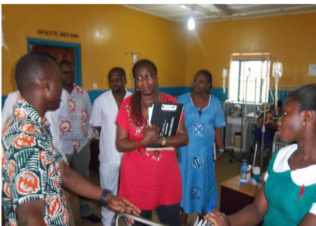
Paediatric Ward, Wenchi Hospital

Wenchi hospital is a compact hospital conducting mobile clinics as part of its outreach activities. 60% of its cases are malaria related however there is increasing request for gynaecological services from over 700 patients in the community. It also wishes to establish a specialist centre for Buruli ulcer by training nurses on disease awareness, early detection and intervention of this disease caused by Mycobacterium ulceran . Cote d'Ivoire has the highest incidence in West Africa followed by Ghana. The disease was first reported in Australia in 1938? The Director of Administration has requested funding support to train three specialists at Obom, near Accra where a specialist doctor manages such cases as well as the microbiologist from Logon University Microbiology department collects samples from patients In support of treatment and record keeping.