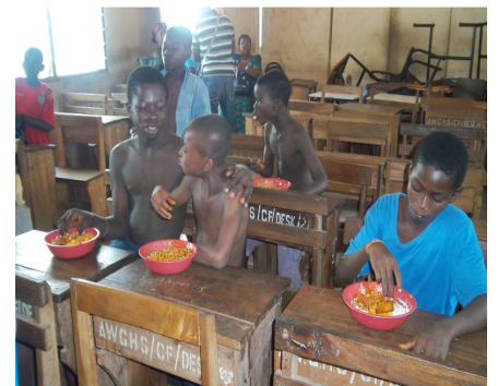
Street kids offered food