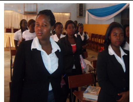
Advanced students at the Women Training Centre