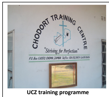
UCZ training programme