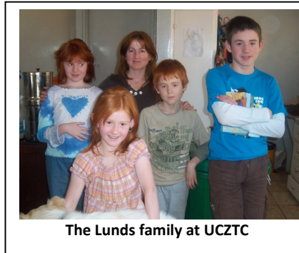
The Lunds family at UCZTC