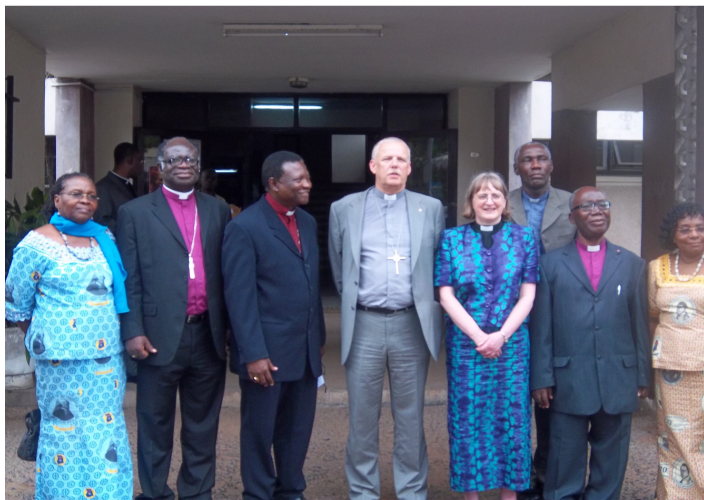
British and Ghanaian Methodist officials in Accra