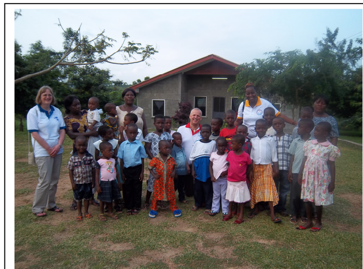
At Rafiki Orphanage