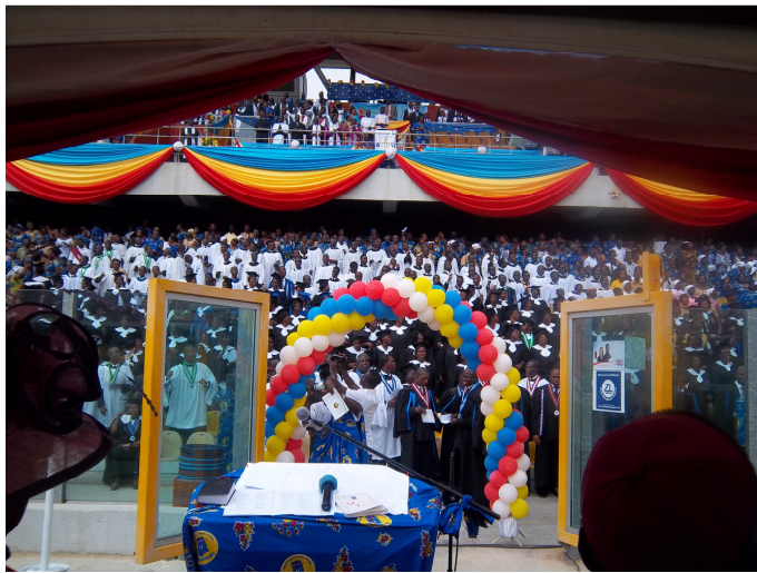
Celebrations at the stadium