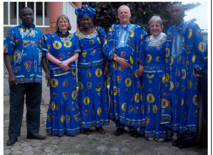
At MCG 50 th anniversary celebrations