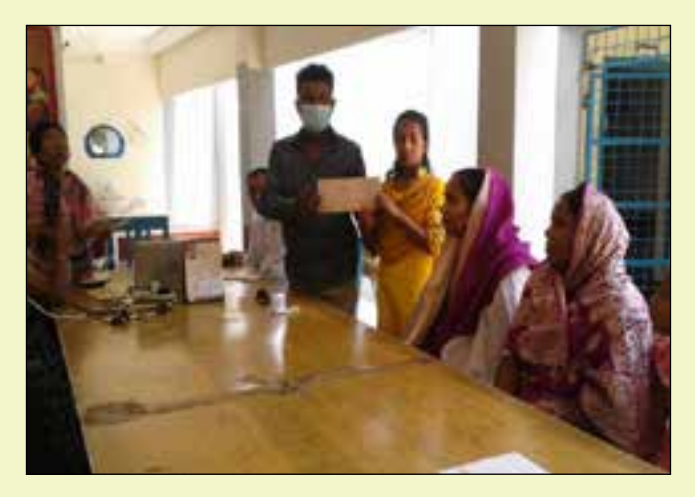
Cash delivered at Home of Bethany CMD Girl's Hostel, Bollobhpur