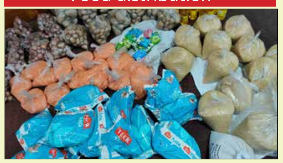
St. Andrew's Church, Mirpur, Dhaka