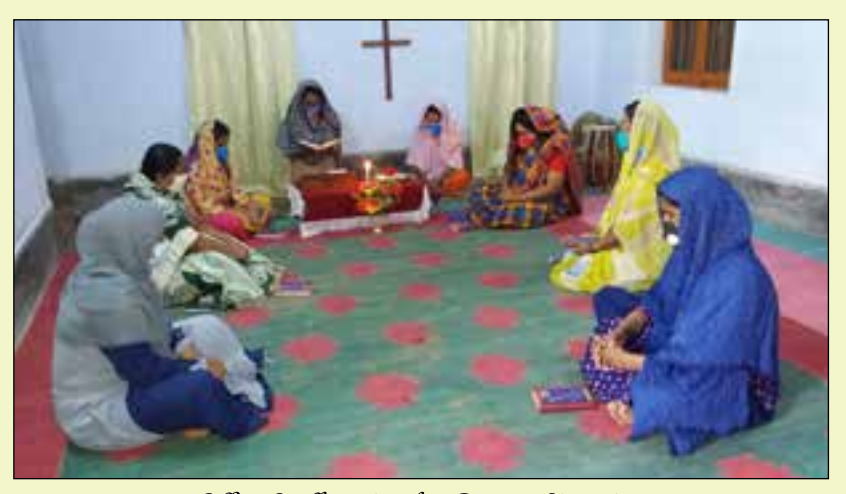
Office Staff paying for Corona Situation

We are saved by the grace of our Lord Jesus Christ. Our Institute is closed since 17th March 2020 that is why, only we are few people living in Nursing Institute since 24th of March 2020, our instructors are in home district, according to DGNM order, Instructors are not able to come back due to Government's order of general holiday until 15th May 2020. But two Instructors who are living in Rajshahi. Now they are coming office for some official works. At present in the month of April 2020, we have three students, two House Mothers and Principal, four Guards, four cookers,one Assistant Accountant, Cleaner ,Office Bearer and also Office Assistant, we are doing Students License and other work in this Month. disease