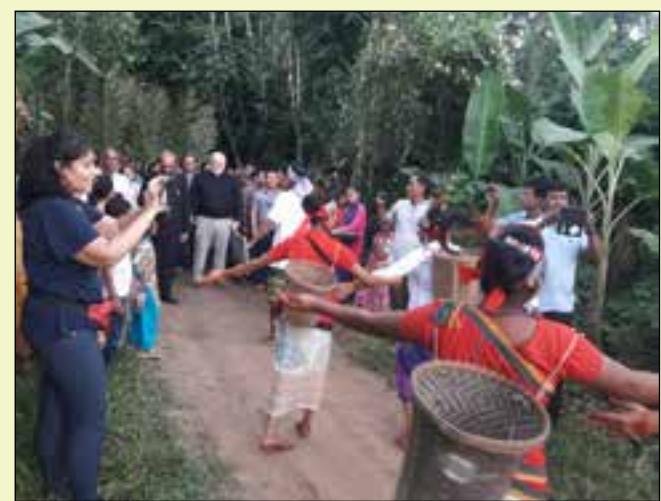
The missionaries visited Thanarbaid Clinic at Tangail District and were given traditional reception.