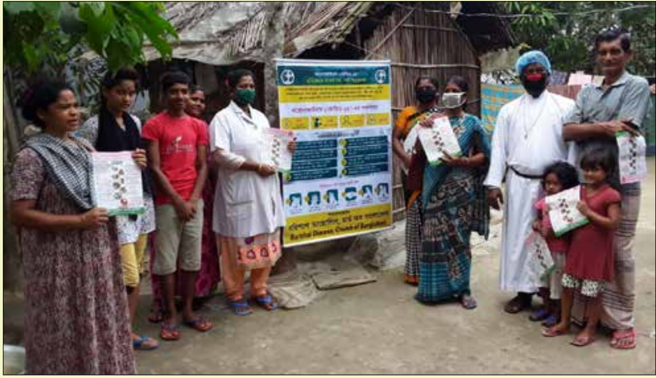
Priest, Nurse and staff led the awareness through leaflet distribution