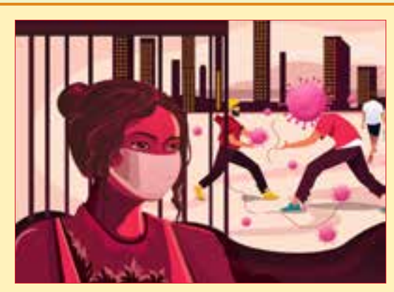
Use mask and Maintain social distance of two meters between each person.