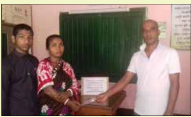
Cash delivered at St. Philip's Boys Hostel, Dhandoba