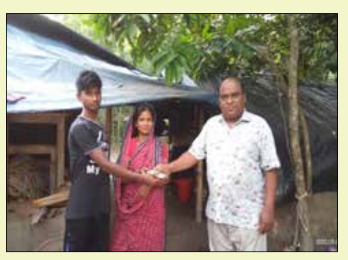
Cash delivered at Dhamshor Boy's Hostel