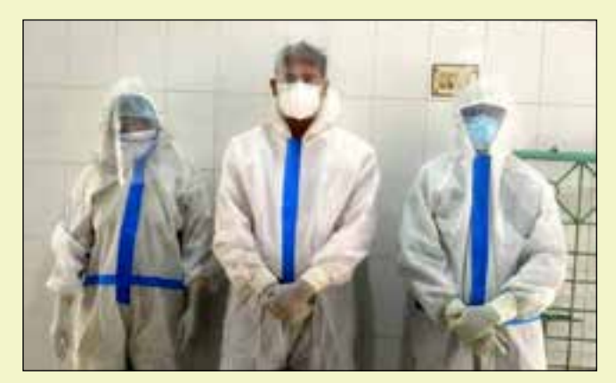
Getting preparation to serve people with well PPE for the affected people at CMH, Rajshahi

A generalized panic started developing among common people since then and they started use of face masks when they were outdoors. With upcoming threats the Rajshahi Authority declared full lockdown of the city in beginning of April.