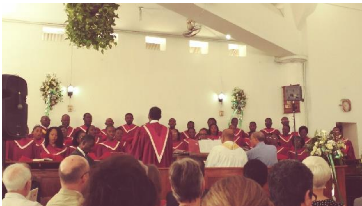
The church choir