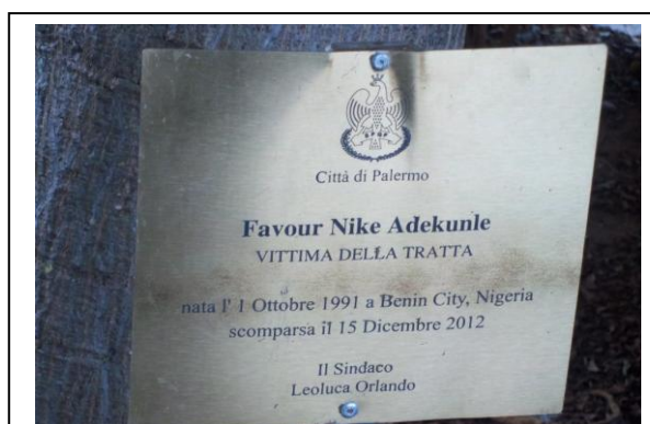
Memorial for one of the Palermo victims