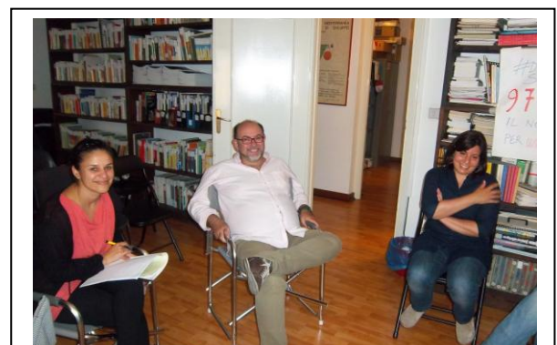
Ciss Human Right NGO officers in Parlema