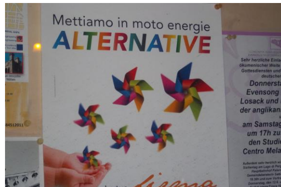
Promoting alternatives to human trafficking

The ultimate plan is to repatriate the ladies willing to go back to Nigeria by paying for their return journey, offer a start up basic business package, work with the Nigerian Ambassador in Italy and help re-establish them back into Nigeria. I plan to link up the Methodist Church Nigeria to also help with the follow up and offer the ladies opportunities to inform young Nigerian ladies to be wary of overseas offers too good to be true. Unfortunately these girls and their parents are targeted due to poverty and or illiteracy. Others were taken by the deceitfulness of easy wealth by evil perpetrators. With God on our side, exploitation would be stemmed and dignity in labour promoted. Or do we stand aside and do nothing?