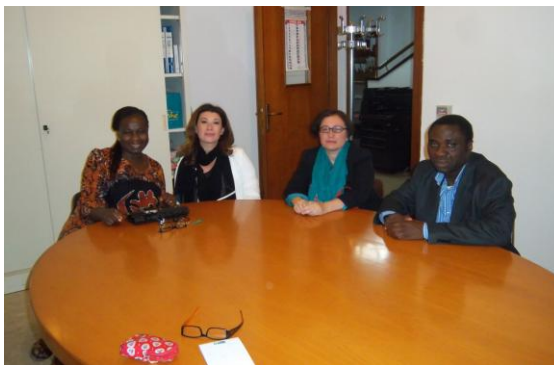
Pilgrims of the Earth executive members