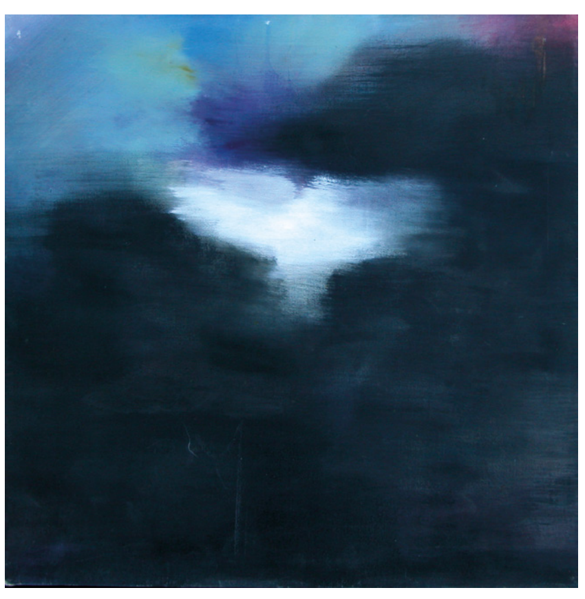
Untitled - Pentecost by John Brokenshire