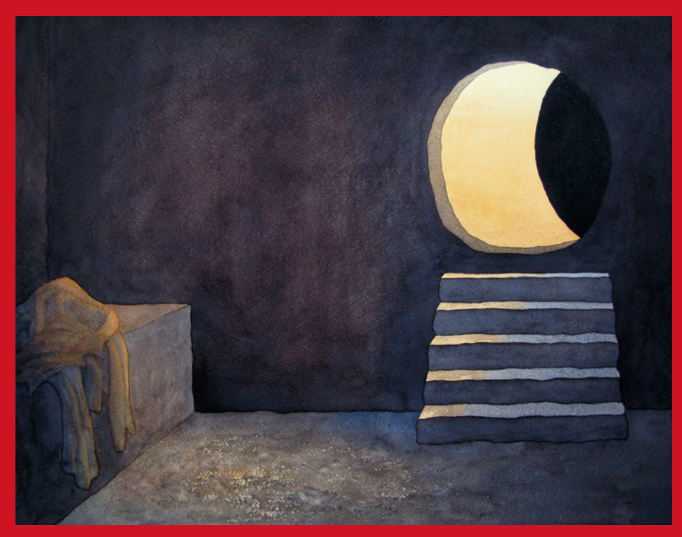
Focolare are promoting their exhibition with Richard Bavin's The Empty Tomb

Deepening the Mystery 'unexpected treasures of art' Welwyn Garden City 1 March to 7 April 2024 Focolare Centre for Unity, 69 Parkway, Welwyn Garden City, AL8 6JG Website: www.focolare.org Contact: Paul Gateshill paulghill@hotmail.com