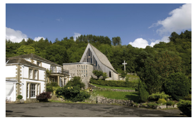
The Chapel at Scargill House

offered information. All bringing the paintings and the artist to life. Soon I was entering each room looking for that one piece of work which would catch my attention and speak to me - something that has continued.