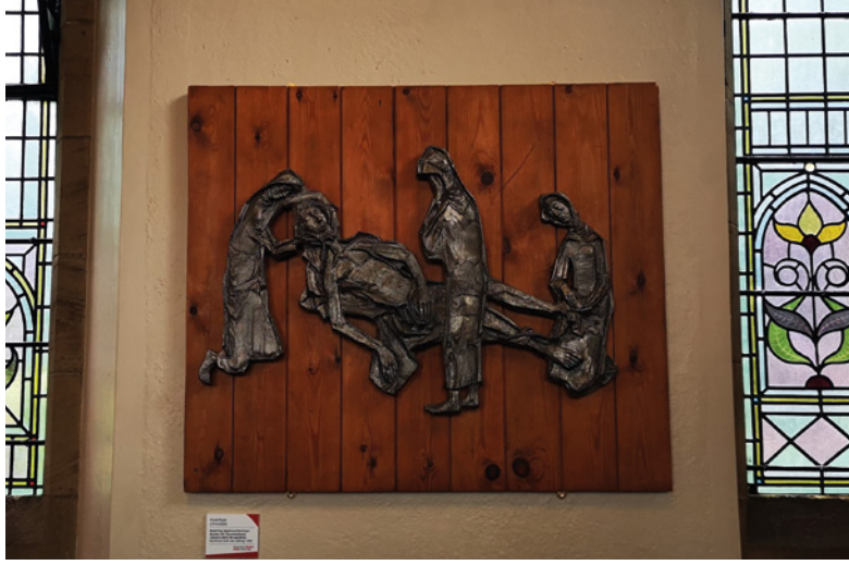
The Entombment, Jesus is laid in the tomb, Station of the Cross No. XIV by Frank Roper on display at Woodhouse Grove Chapel (© TMCP) (photo courtesy of Ann Sumner)

Roper working in polystyrene in his studio in Penarth (photo from Wikimedia Commons, the free media repository)