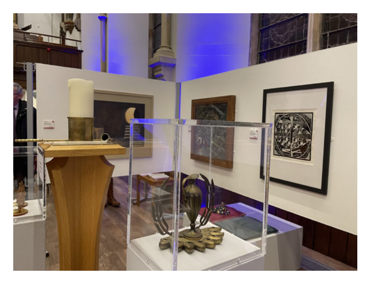
Three pictures from the Collection (© TMCP) on display with artefacts from other faith traditions at Victoria Methodist Church (photo courtesy of the Editor)

Victoria Methodist Church, Bristol, 20 February-8 April 2023