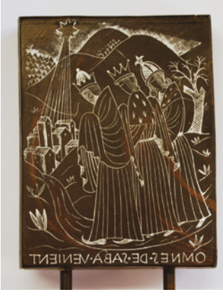
Three Kings by David Jones, engraved woodblock (image reversed)

Front Cover: Works from the Collection on display with artefacts from other faith traditions at Victoria Methodist Church Bristol.