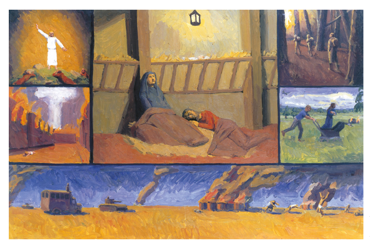
Nativity Polyptych by Francis Hoyland Di and Phil Stones' choice from the Collection

Surely a message relevant for today - that in a world of fear, love wins.