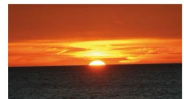
Looking at the sunrise emerging over the sea we are reminded of all the hidden treasure given to us by God.