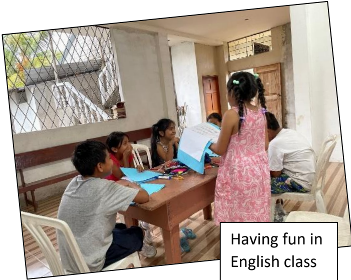
Having fun in English class