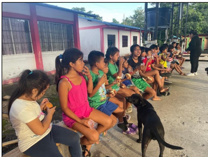
Snacks in Shiripuno