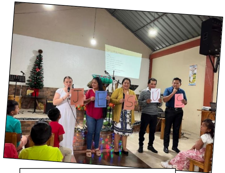
Above and below: Presentations at Christmas service