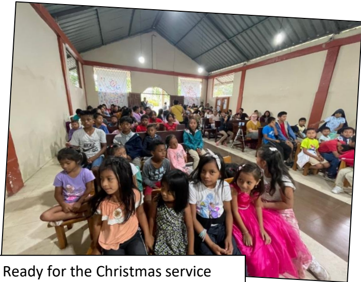
Ready for the Christmas service