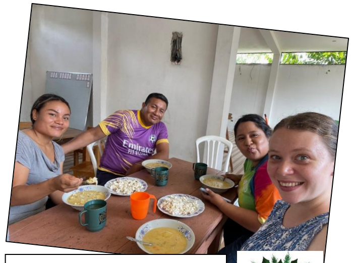
Getting our own lunch after serving the community lunch