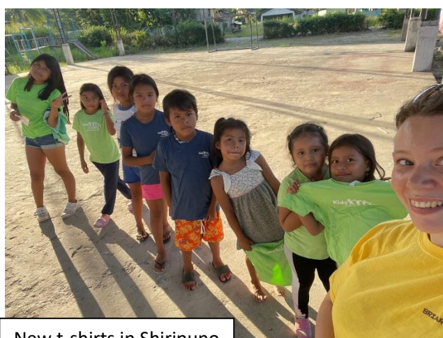
New t-shirts in Shiripuno