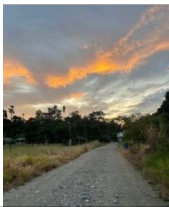
Sunset on the way home from Shiripuno

In the church plant in Ongota, there are now bi-weekly Sunday services. On Sundays, I am in Misahualli, but I continue to go to Ongota every Saturday. Around 6 months after we first started in Shiripuno (a short distance up the River Napo) we have around 15 children who come every week. It has taken a lot of persistence to get to this point, and we give thanks for this little group, and pray they continue to come and learn more about Jesus.