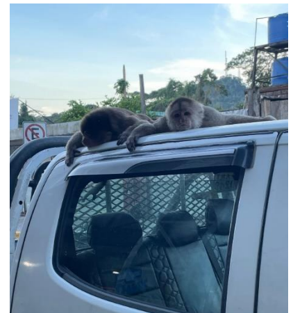
Just chilling – it's good to be a monkey in Misahualli

Elections – after a lot of uncertainty in the past few months, Daniel Noboa was elected president without any fuss on 15 th October. He takes up office in the next few weeks, as the youngest Ecuadorean president, aged 35.