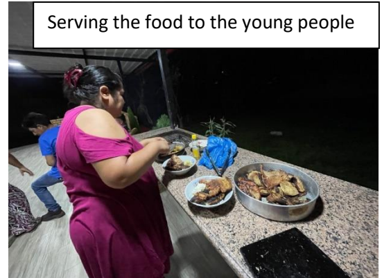
Serving the food to the young people

Unfortunately, I was sick for the better part of 2 weeks in September. This was a strange and unfortunate start to the 'new' year, but with some work, we got things going again. One of these events was a 'parrillada', which is a South American barbecue, for the young people. We have a new season of meetings for them in November, so please be praying for that.