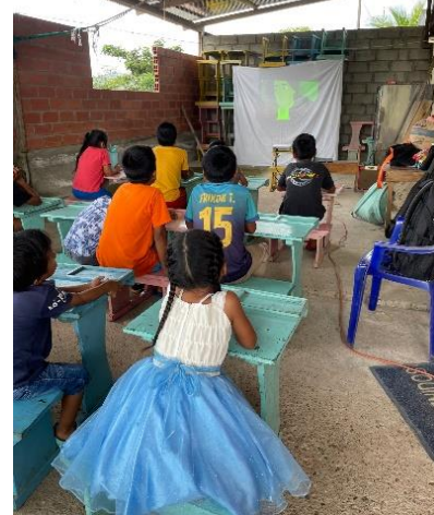
Kids' club in Ongota continues.

English classes have made me smile a lot recently – there are more classes, covering various levels and ages, even though numbers have been smaller, but everyone who is coming really wants to be there, and they are doing so well. The biggest surprise for me has been the 5–7-year-olds, as I am not used to teaching that age group, and often I think they don't have a clue what I'm teaching them, but then the following week, they just regurgitate everything from the previous week. One week, we did items in our pencil case, and the following week, I said 'everyone, get out a pencil' and when I turned around, everyone was holding a pencil. Result!