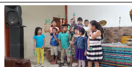
The Sunday School on Palm Sunday