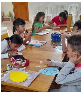
Decorating Easter eggs in English class with new phrases learnt