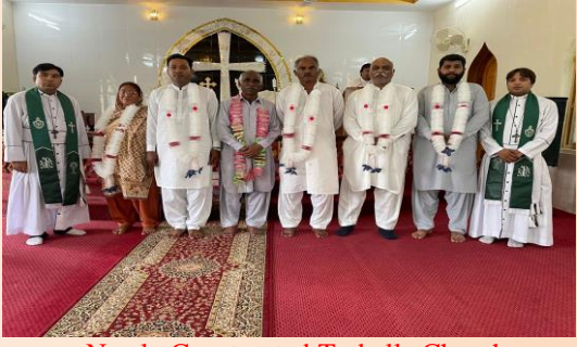
Newly Constructed Tarbella Church