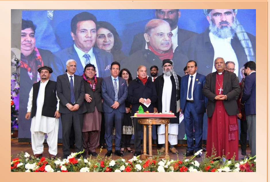
Christmas Celebrations at Prime Minister House