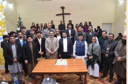
Multi-Faith & Ecumenical Leaders at Diocese of Peshawar Church of Pakistan