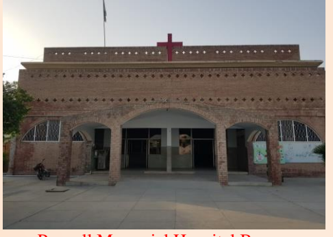
Pannell Memorial Hospital, Bannu

All the Health Services are also part of the Government Macro Plan for health in the country and they also coordinate with other sector of Government, such as Ministry of Health, and Ministry of Social Welfare, and Special Education.