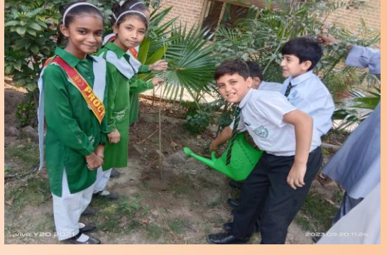
Diocesan School Curricular and Co-Curricular Activities