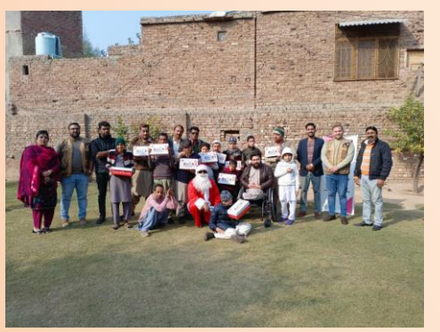
Mental Health Centre, Peshawar