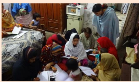
Adult Literacy Classes

The Development Sector through its various programs and projects, such as Skills Training Programs, Women Empowerment Projects,, Adult Literacy Program, Sewing Skills and Interfaith Harmony Programs helps to rebuild selfconfidence of the individuals from oppressed communities, thus improves their quality of life, as well.