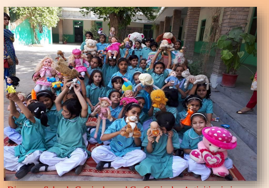
Diocesan Schools Curricular and Co-Curricular Activities in images

Christian community is carrying -on the legacy of serving all communities in the fields of Health and Education without negative discrimination. The Diocesan Schools are popular for being Educational the best Institutions, and the majority community prefers to get their children educated in Christian Educational Institutions.