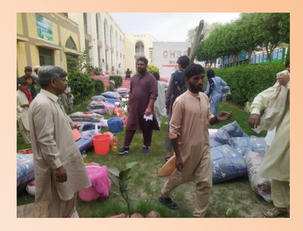
Flood Relief Activity in Images