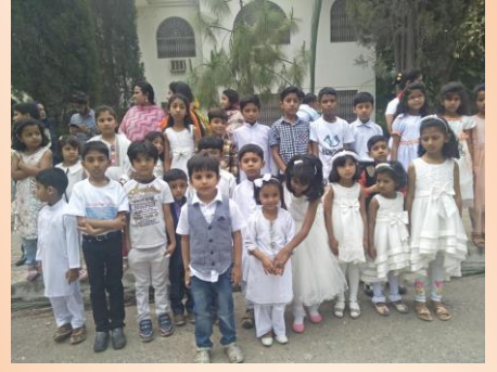
Junior Church, Diocese of Peshawar