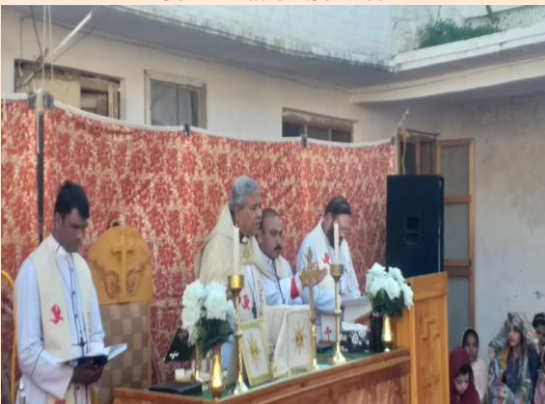
The newly Acquired Church at Swat