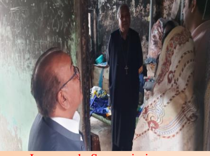
Jaranawala Survey in images