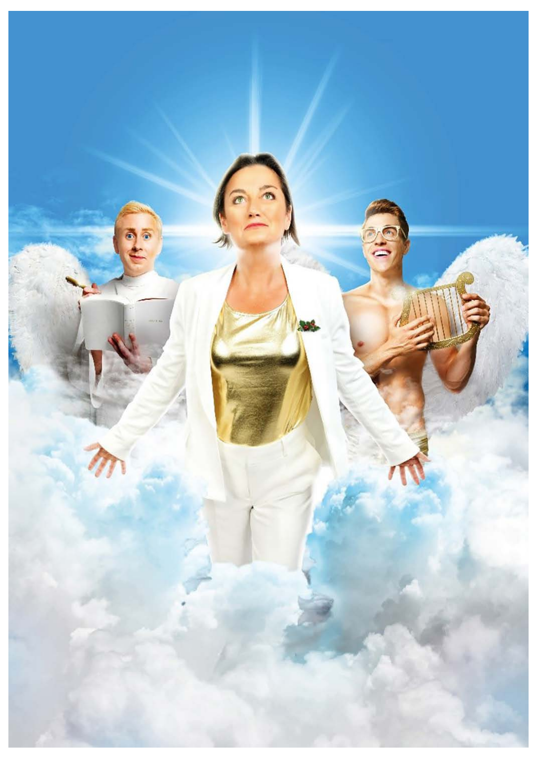
Zoe Lyons as God in An Act of God Play by David Javerbaum Publicity still Promotional Photo from Seabright Productions November 2019