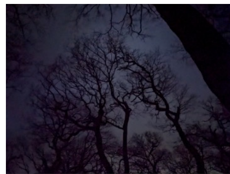
Winter Oak. Photo credit – Paul Rose