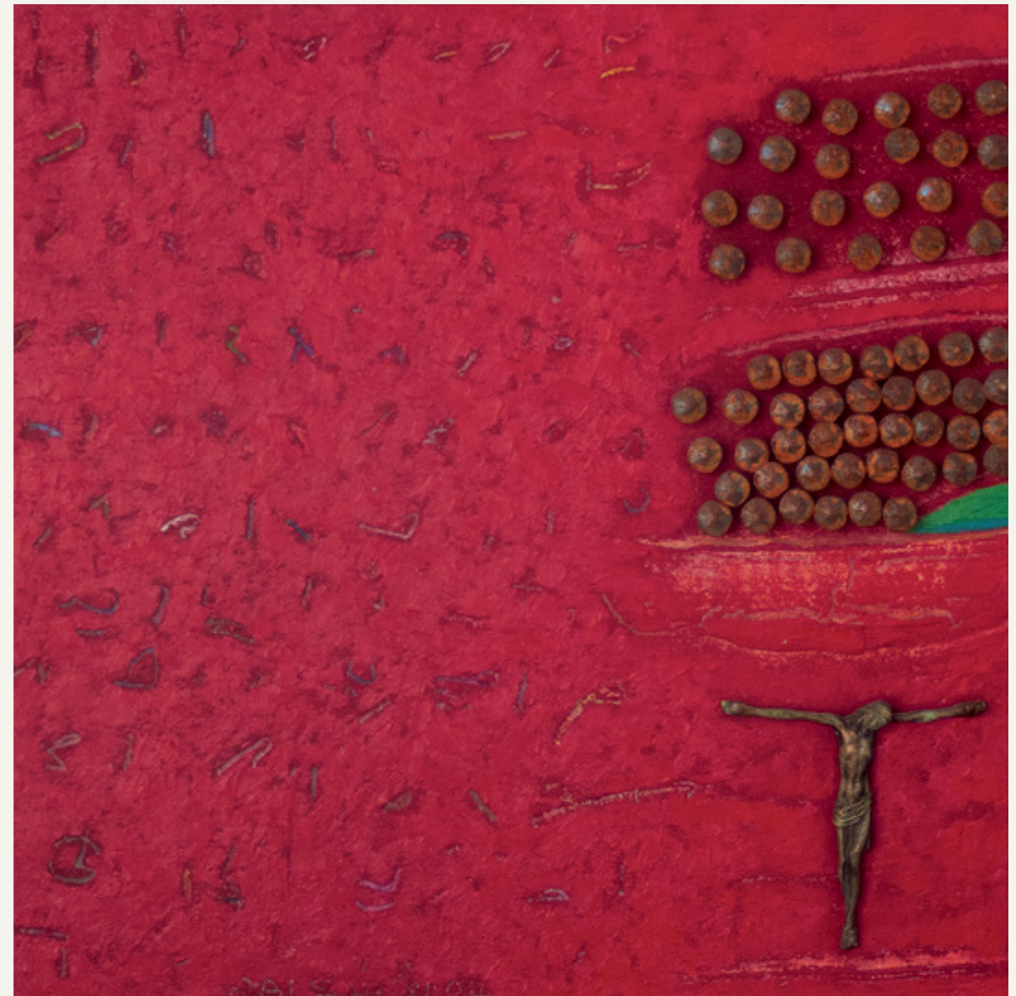
Qassim Alseady, Crucifixion with nails , 2004, mixed media

a profound respect for the prophet Jesus. In his painting Crucifixion with nails (2004) the suffering, crucified Christ is represented by the rusted nails driven into the board. Around the nails and corpus from an 18th-century devotional crucifix are hieroglyphs or indecipherable