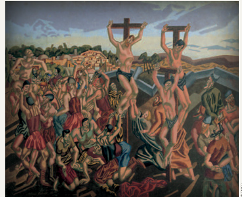
William Roberts (1895-1980), The Crucifixion , c. 1922, oil From the Methodist Church Collection of Modern Christian Art