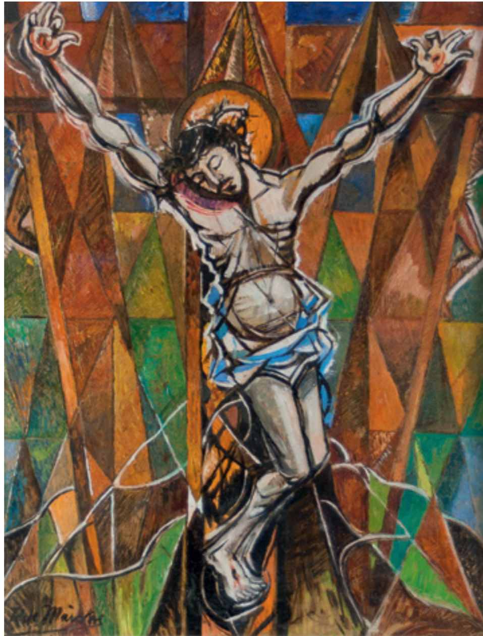
Roy de Maistre, Crucifixion , c. 1959, recently exhibited at Monnow Valley Arts.