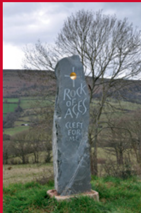
Rock of Ages, Monnow Valley Arts Sculpture Garden.