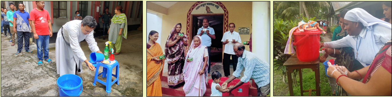
Health package (bucket, mug, mask, gloves & sanitaizer) distributed among 109 parishes.