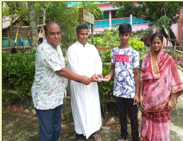
Cash Support at Dhamsor Boys' Hostel