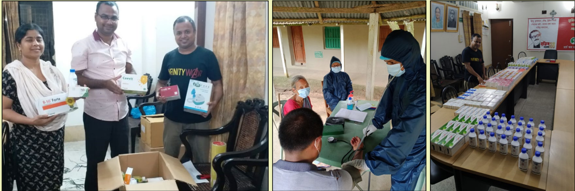
Medicine support from SMCOC Egypt for tribal people of Mymensingh, Netrokona, Sherpur and Tangail districts.