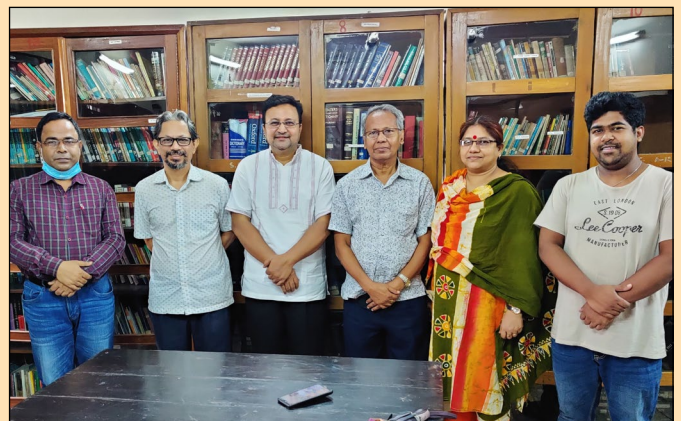
Meeting with few advisors for SATC policies