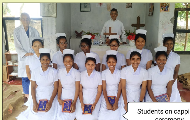
Students on capping ceremony