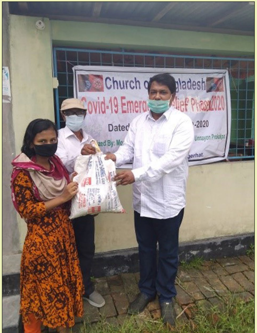
The CoB also raised local donation to distribute food package to the needy in the COVID-19 crisis

In addition, we are very grateful to USPG and ERD for their kind financial supports for purchasing materials and essential medicines for health awareness and health protection. We have been able to deliver the health care equipment and we have distributed those material through their donations for 109 parishes and 11 clinics. We estimate that at least 30,000 people are directly or