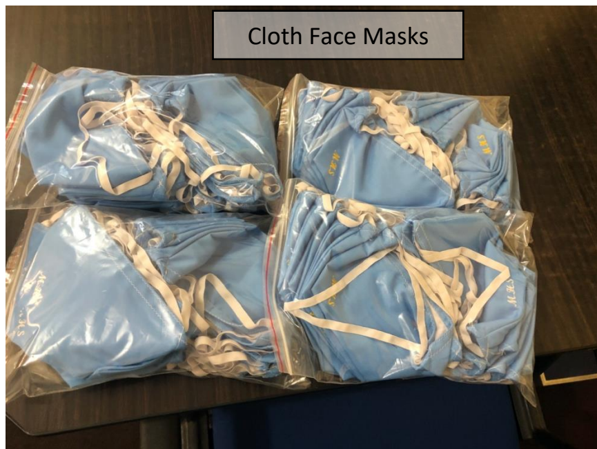
Cloth Face Masks