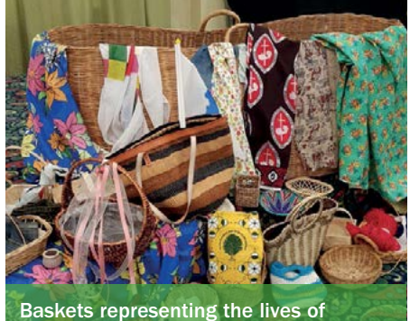
women affected by violence

Participants then shared a vision of unity and equality as they sang and danced to the glory of the Lord.