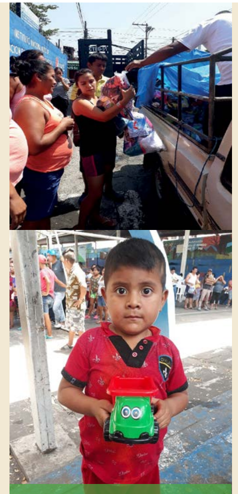
The church offering practical help to those in need

A grant of £10,000 was sent by the Methodist World Church Fund to support the local church. This was used to buy essential supplies such as food, clothing, bedding, toys and toiletries for over 300 families left destitute by the disaster.