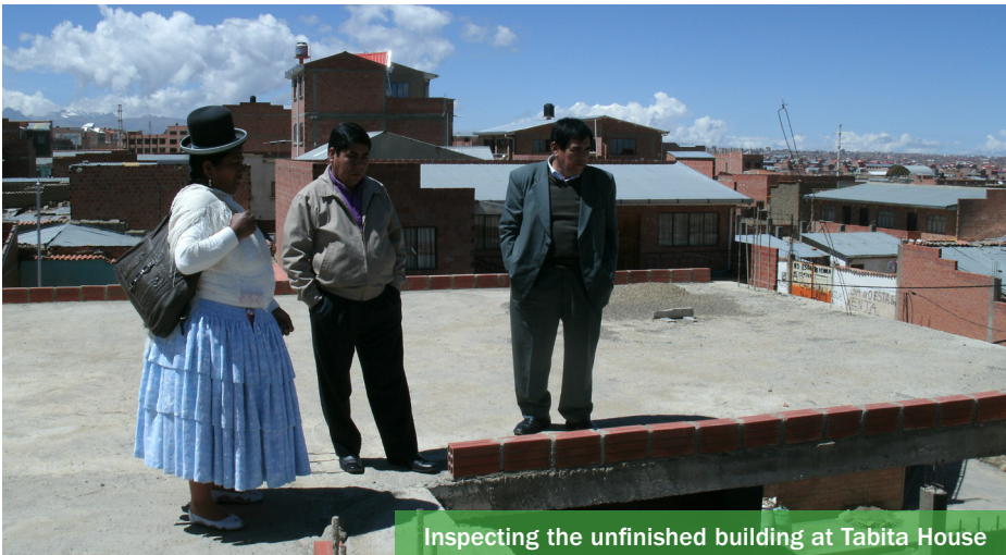
Inspecting the unfinished building at Tabita House

Over the past year around half of the amount needed has been raised. Last November the MWiB trustees, agreed to forward the full amount to Bolivia so that the work could be completed. Any further funds raised will recoup the deficit and any surplus sent will be used to equip the building.