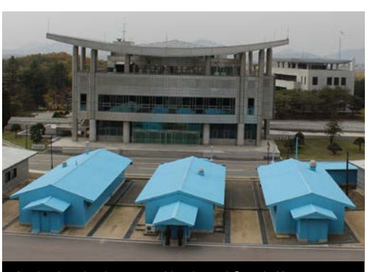
At the border between North and South Korea

he love of sport has long had a unifying effect on people. In fact, in ancient times, a 'sacred truce' would be announced before the Olympic Games began, calling off all