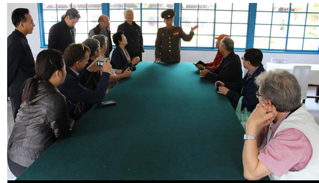
The table at which the Korean Armistice Agreement was signed in Panmunjom, North Korea