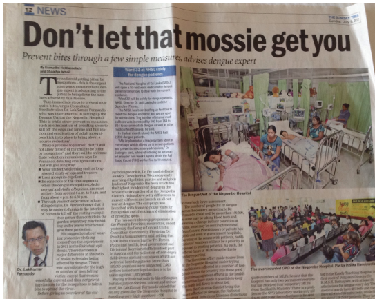
Final newsletter from Sri Lanka!

Last month I received the decision on medical advice that I was unable to live and work in a country with dengue. Therefore with a heavy heart I returned to Sri Lanka from the 7th - 13th July to prepare for closure on what has been an amazing two years. Unfortunately the mossier did get me for the second time and as a result I was seriously ill. The newspaper article is dated the 9th July reporting that the official numbers of dengue patients this year is 80,000. There are fears