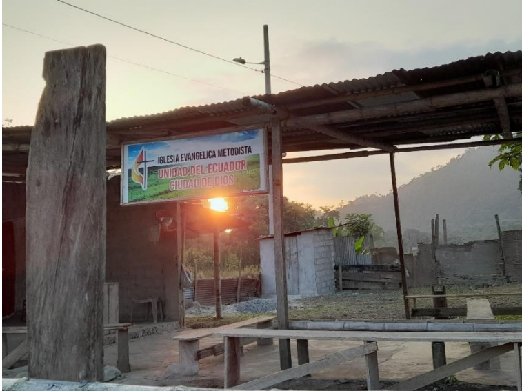
A beautiful sunset shining through church plant 'Ciudad de Dios'