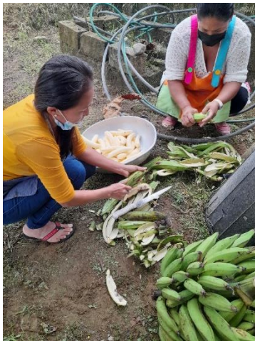
Preparing plantain for over 100 young people's breakfast at the youth event