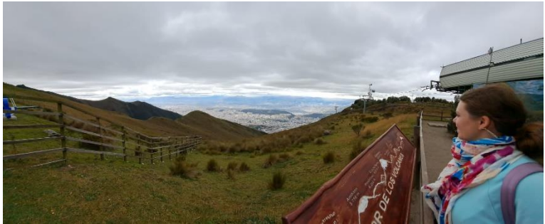
Enjoying the view over the mountains and valleys (Quito is the dots in the valley beneath)