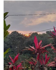
The predictable, but beautiful Ecuador sunset

Having lived in Northern Europe, living on the equator is a funny experience. When I arrived at Dublin Airport in the early hours of a wintery February morning, the temperature was hovering around 0°C, and it was still dark. Now, if you're in the Northern Hemisphere, you've seen the days lengthen in Spring, and with Summer past, the days are once again becoming shorter. When I arrived in Ecuador, the sun rose just after 6am, and set just after 6pm, and it has continued to do that every day since. Here, there are only two seasons, marked by the amount of rain that falls, so it's hard for Ecuadorians to imagine a country with 4 distinct seasons, and days that change length according to the time of year. On the other hand, it's reliable, predictable and practical.