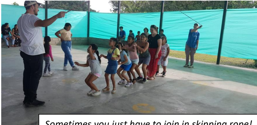
Sometimes you just have to join in skipping rope!