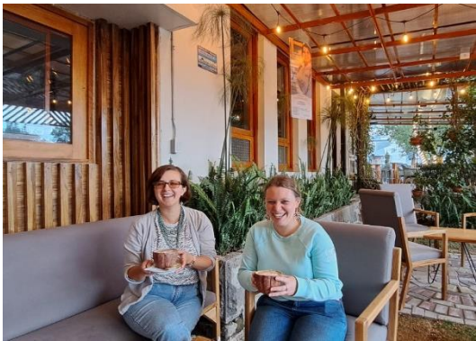
Enjoying a special hot chocolate (from local cacao)