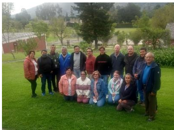
Pastors and mission partners on retreat