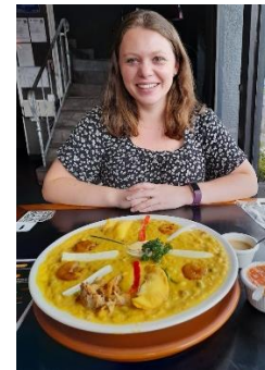
Holy Week meal made of grains, pulses and salted cod – 'la fanesca'