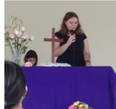
Speaking at the Good Friday service, about 2 hours before I took sick