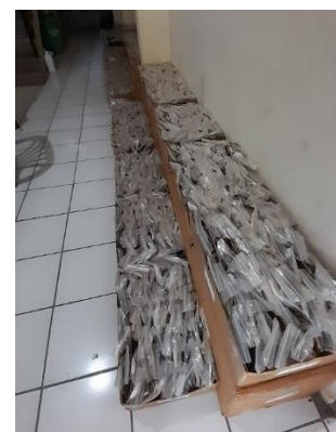
More than 2000 glasses waiting to be given out

March got off to a slightly different start than initially expected. Just three days before they arrived, I was asked to accompany and translate for a team from South Carolina who were due to hold medical and eye clinics organized by some of the churches in the coastal region of Ecuador. The team was mostly comprised of students, accompanied by a doctor, an optician, and the pastor who was the team leader. They arrived with more suitcases of medicine than I have ever seen and over 2000 pairs of prescription glasses, as well as the equipment to work out people's prescriptions and find them glasses which matched that prescription! The local churches had been responsible for advertising the clinics, and many people waited for hours to be seen, making it a tiring and hot week. Nevertheless, it was a great week for both the team and the churches. It was also very interesting to be on the host country's side and I look forward to more teams in the future.