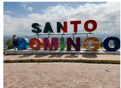
At the ‘Santo Domingo’ sign overlooking the city

Ecuador is divided into four regions – the Amazon, the Andes mountains, the Galapagos Islands, and the Coastal region, although I am two hours away from the coast, it still comes under the coastal region. The next day I arrived in Santo Domingo de las Tsáchilas (after descending over 2000m through the Andes) and to the superintendent’s house, where I am currently staying. Unfortunately, the same cannot be said for my suitcases, which had stayed in Madrid, but happily we were reunited after five days.