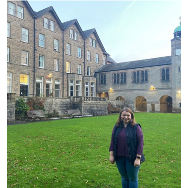
Cliff College, Derbyshire

Much of the blessing of the past three months has been from sharing the experience and preparation together as we have supported each other through training, assignments and practical preparations. We also shared many fun occasions, laughter and a beautiful weekend in the snow.