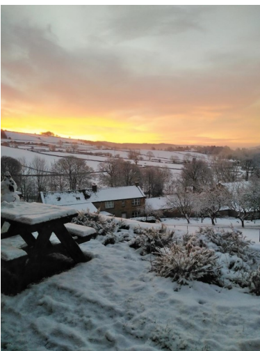
Sunrise at a snowy Cliff College

Most of us have finished our time at 'Cliff', and I am back in Northern Ireland until late January/early February, where I will be finalising preparations for leaving, and doing some more training online, as well as spending Christmas with family and friends. My exact leaving date depends on when my visa comes through. When it does, I will be moving to Santo Domingo de los Colorados in Ecuador to work as a mission partner with the United Evangelical Methodist Church of Ecuador. My role will be split between teaching English and building a discipleship programme for young adults. It is a very exciting time, but there is also a lot to do, and of course it is emotional, and accompanied by all the nerves you would expect.