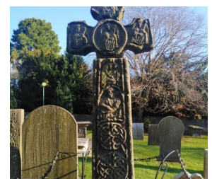
Celtic Cross, 8th Century in Eyam village, Derbyshire