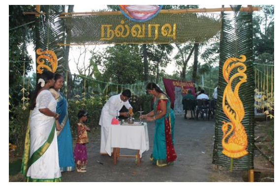
The entrance to the event which began at 6.00am

Farming tools were then brought forward and placed in front of the table. The elements at the Communion Service were traditional symbols of a rice dish and then mixed fruit.