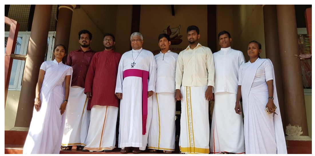
Seven, of the eight, Methodist students who will be entering circuit ministry shortly with the President/Bishop of the Methodist Church in Sri Lanka

There are eight students leaving who will be promptly inducted as Methodist probationary ministers. I have the honour of presenting them with their "Collars" within the next few days.