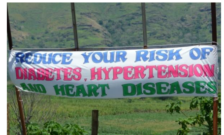
Sign outside Tavua Local Hospital, Western Division, Fiji