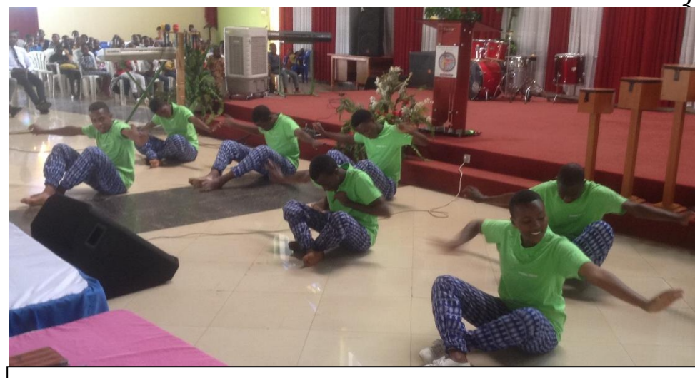
Youths drama group during Sunday Service at FMC Cathedral