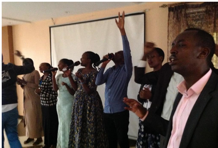
Congolese Methodists from UMC Uganda

We had a 'Holy Communion service' to round up the retreat and some Nicon Hotel staff joined in. Throughout the retreat, each evening ended with a short exhortation with prayers, led by various mission partners. It was inspirational.