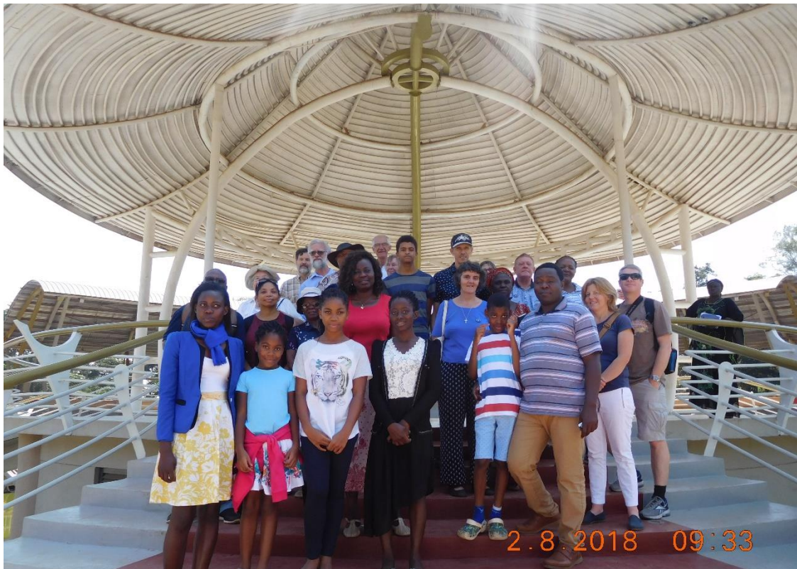
At the Catholic Martyr's Centre, Kampala - Uganda

We had Methodist Church youths minister to us on one of the days and the United Methodist Church members, who were mostly Congolese living in Uganda, also came on another day. We had various sessions for mission partners to share among themselves to help replenish, rekindle and renew their vision for service throughout the retreat. I also had the privilege of