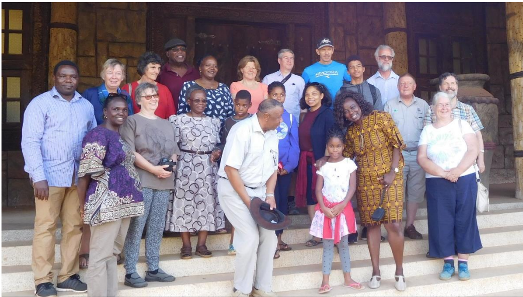
MCB mission partners with families members serving in Africa & Caribbean