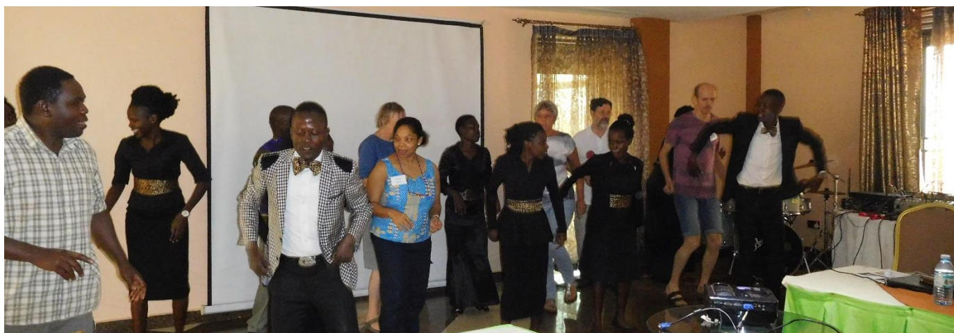
Methodist Church Uganda youths with MCB mission partners praising God together

because she felt her hard work all these years were not validated. She then travelled to Canada for a month and came back after which God transformed her from within to without, reassuring her that He had