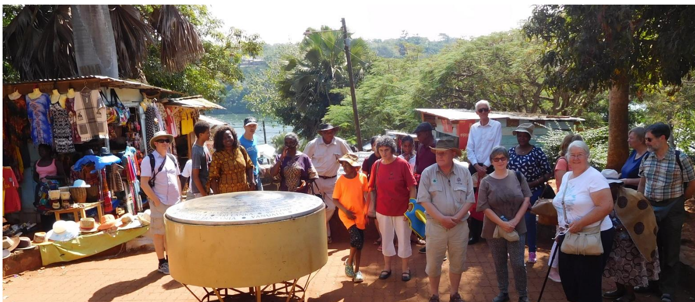
A visit to the source of the Nile at Jinja