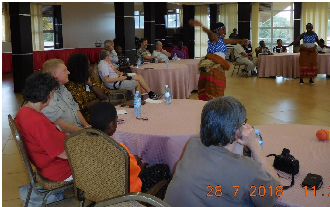
MCU ladies welcoming mission partners with traditional dance

Yes, we were in Africa, with the cock crowing away very early in the morning, waking us all. I was so proud to see everyone up and