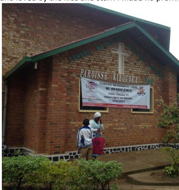
Free Methodist Church Kibogora; 1942 - 2017

Later I accompanied FMCR superintendents with Board members in two vehicles embarking on a five hour road journey to Kibogora where we met the disbanded FMC celebration committee members. The church had a very successful 75 th Church Anniversary in August 2017 as a result FMC Church leaders were visiting to thank them for their dedication. FMC Rwanda had guests from Britain, America, Congo and Uganda with MCB represented by a team of Wolverhampton Methodists. The evening gathering went well and we were treated to a lovely meal after pleasantries. I was given an opportunity to bring greetings from MCB. I went to bed exhausted and happy.