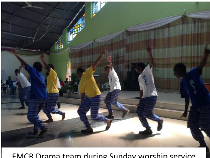
FMCR Drama team during Sunday worship service