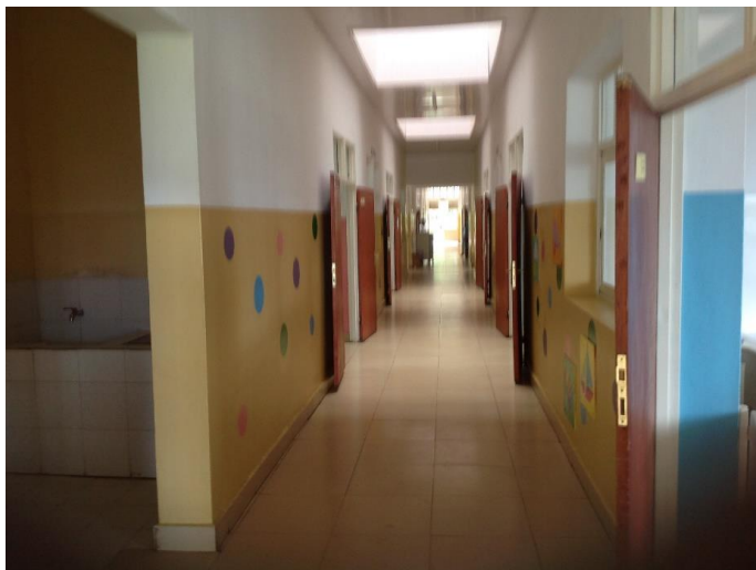
Recently built Paediatric Ward at Kibogora Methodist Hospital

scattered in the community. The ambulance sometimes pick up patients living two hours' drive away by road. The untarred roads could be quite treacherous in the rainy season however it was good to know the ambulance service was operational. The maternity and surgical wards were the oldest building and in need of expansion therefore the