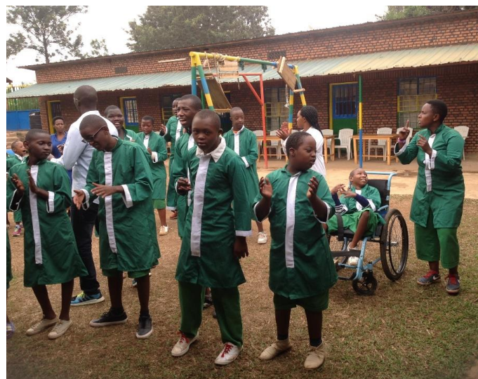
Amizero Special Needs pupils on school grounds