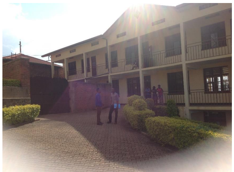
Block of classrooms and library at Kibogora Polytechnic