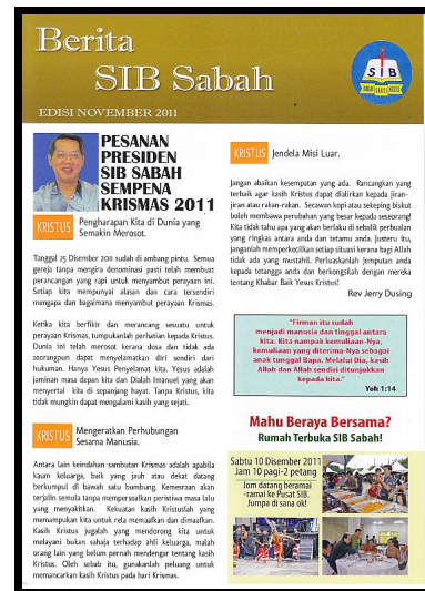
Cover Page of Newsletter

Just recently a young Design graduate has assisted us and I am hoping she may be able to work with us on a more full-time basis and take over the administrative side that I have been largely handling. As a development from Media Productions we have just produced the first newsletter for the Church Headquarters and this will hopefully be continued on a regular basis.