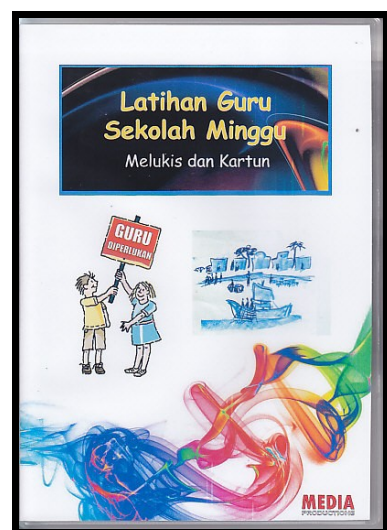
Cover of Artwork DVD for Sunday School Teachers

The other area that has consumed a lot of energy has been the development of a Media Ministry. Since the beginning of May we have set up Media Productions housed in the SIB church Headquarters but operated as an independent entity with its own oversight group and independent funding. Currently the group has a part-time technician who handles the filming and editing as well as an assistant who comes in to work on a project basis. The group is funded through the sale of products or through charges for filming and production of video materials. The aim of Media Productions is to prepare teaching, promotional and outreach materials.