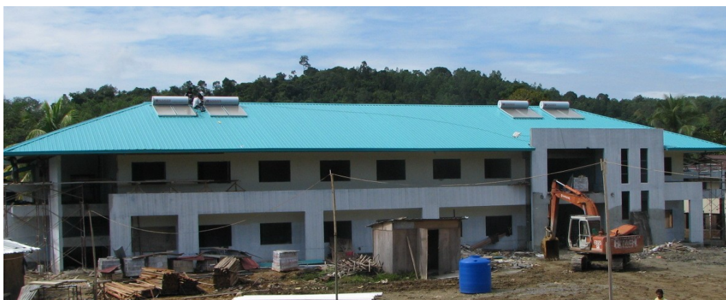
New Student Hostel Nearing Completion (December 2011)

My main role at the moment is as Development Co-ordinator for MTS, the rural Bible College. This is an all-encompassing role that embraces curriculum, staff training, accreditation and infrastructure. This year we have finally (I think) agreed the constitution of the College Board and now the challenge is to get it functioning effectively. We have also developed some new curricula and finalised (I hope) a staff manual that provides guidelines for best working practice, regulations and responsibilities. We also have 4 lecturer candidates studying overseas in English - that was a major challenge, as English is not widely spoken here in Sabah but is very important to bring the College and Church into the 21 st Century.