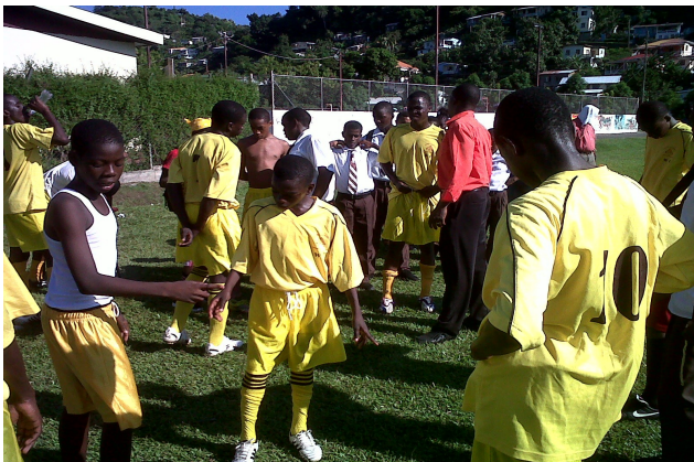
Wesley College Junior Football team, first game of the season, won 3-0!

"How old is Jesus? Which religion is right? Is there a hell? Is the devil Gods first son? Where is heaven? If God loves us, why do we continue to hurt him by sinning every day? Is God black or white? I know the Devil is real but I am not sure that God is real, I can't see him, I can't hear him and I can't touch him, explain that? Does God forgive you even if you know what you are doing is wrong? Why don't some people believe in God? Who wrote the bible? How do we know the bible is true? How do we ask God for things? Where do demons come from? Why did God make Hell? How do we know that which day is the real day that Jesus (God) rested? Why do Methodists eat pig and drink caffeine when the bible also stats that its unclean? Why are there different religions?"