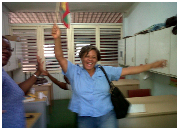
Science teachers celebrate Kirani's win!

I could not finish this letter without mentioning Kirani James, the nineteen year old Grenadian 400m runner who won the gold medal at the recent world athletics championship. Everyone on this small island is so proud that he has put Grenada on the map. Now we are looking forward to the Olympics in London 2012, when Grenada is looking forward to its first Olympic medal being gold!