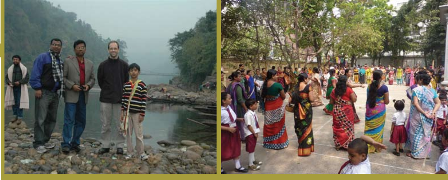
Hills - on the Indian border

that blocks would fall into place, that some clarity would emerge and that it will become clear how we can continue to serve God in Bangladesh in the months and years to come.