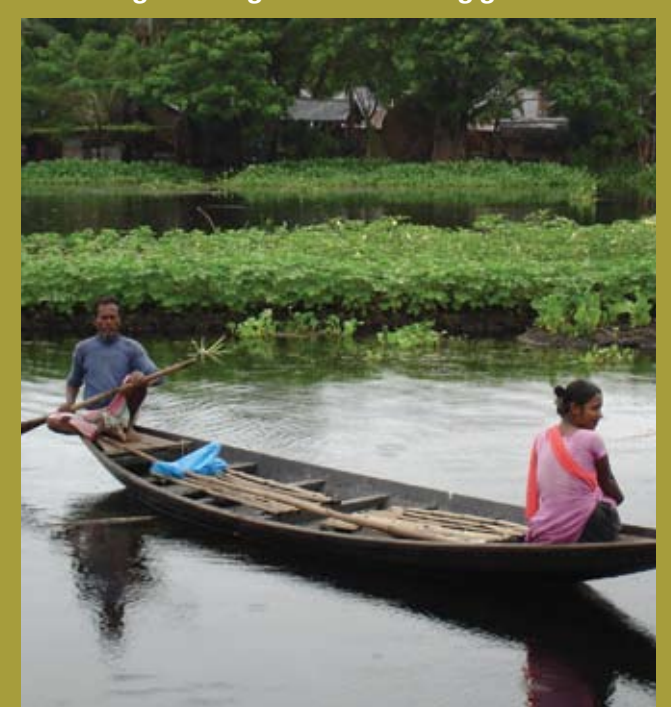
Vegetables grown on floating gardens

We hope you will join us in this journey of faith by praying